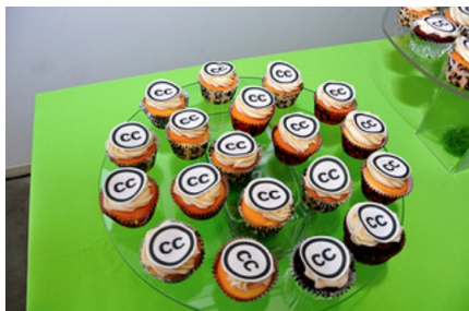
Attribution of Original Work

" Creative Commons 10th Birthday Celebration San Francisco " by tyol is licensed under CC BY 2.0