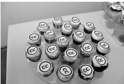
Attribution of Modified Work

" Creative Commons 10th Birthday Celebration San Francisco " by tyol , used under CC BY / Desaturated from original