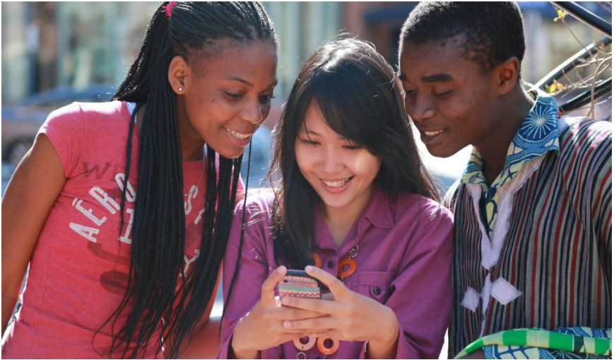
IMG_1505.jpg, MAFS-USA Intercultural Program via Flickr, CC BY-SA

online about them has dates associated with it, and they believe that employers will recognize this and cut them some slack. "She was just a typical, crazy college student" or "everyone experiments with stuff like that in high school" are not good defenses, and your employer will probably not give you any benefit of doubt, because instead of asking you about it, they'll most likely just throw out your résumé, no questions asked. Schools don't want college kids teaching their students; they want competent professionals. So, you need to show them that you aren't just "a typical, crazy college student." You should try to show them that there is nothing in your life that could be interpreted as immoral or inappropriate, no matter if it happened last week or ten years ago.