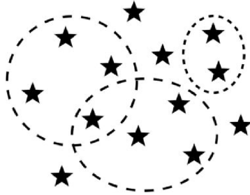
Figure 1. Communities of Innovation

Flat, Organic, & Flexible Organization Productive Failure Promote Mastery, Purpose, and Autonomy Community and Psychological Safety