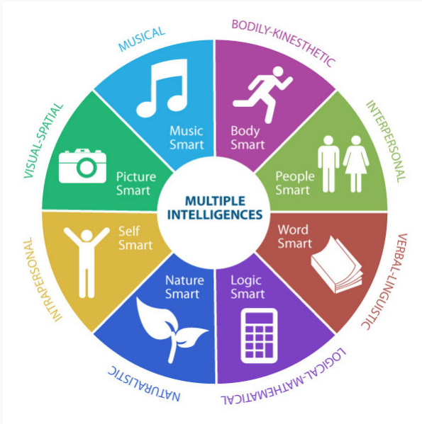
Figure 2. Multiple intelligences theory proposed by Gardner.