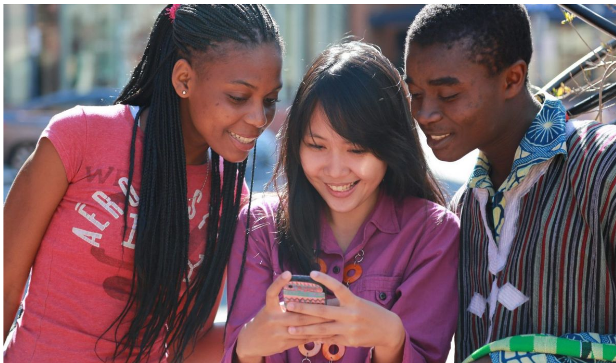
IMG_1505.jpg, MAFS-USA Intercultural Program via Flickr, CC BY-SA

Sometimes student teachers might think that they're safe, because any questionable content that employers might find online about them has dates associated with it, and they believe that employers will recognize this and cut them some slack. "She was just a typical, crazy college student" or "everyone experiments with stuff like that in high school" are not good defenses, and your employer will probably not give you any benefit of doubt, because instead of asking you about it, they'll most likely just throw out your résumé, no questions asked. Schools don't want college kids teaching their students; they want competent professionals. So, you need to show them that you aren't just "a typical, crazy college student." You should try to show them that there is nothing in your life that could be interpreted as immoral or inappropriate, no matter if it happened last week or ten years ago.