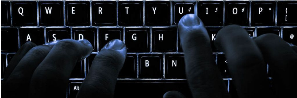
Eine Computer-Tastatur

In the context of online security and safety, a hack is when a person or program bypasses or tricks normal security procedures in order to gain access to a site or service. Hacks can be problematic for everyone, because it means that a hacker can gain access to personal information about users, such as credit card information or passwords, or make online purchases or use services without consent. Even legitimate websites can sometimes be hacked, giving hackers access to company information or personal information of users. Sometimes these websites are hacked at a site-wide level, wherein lots of users information is compromised, but it is more often that they are hacked at the user level, wherein a hacker gains access to a single person's account.