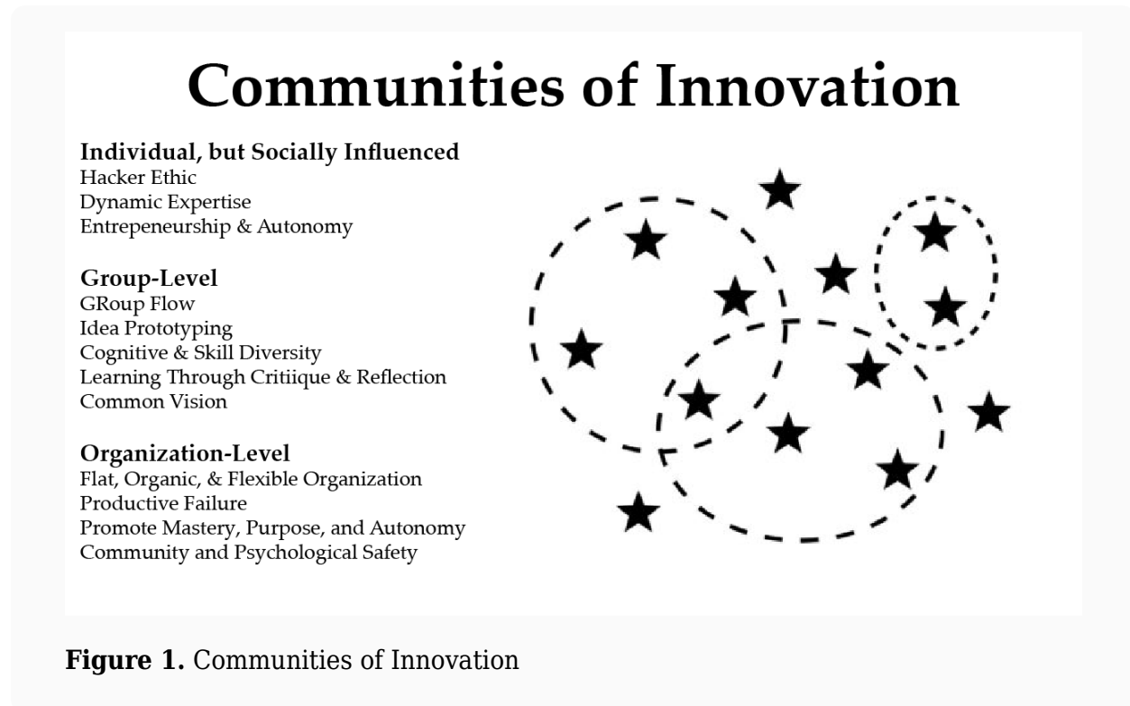
Figure 1. Communities of Innovation

A Community of Innovation (COI) is a group of people focused on producing innovative outputs in a collaborative environment. Different COIs may have varying attributes or qualities that make them successful, but in general COIs have similar characteristics at the individual, group, and organizational levels (see Figure 1).