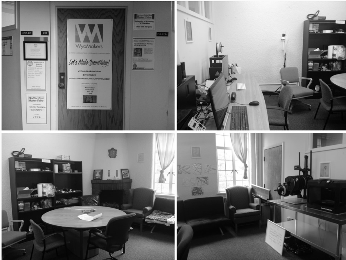
Figure 2. WyoMakers makerspace at the University of Wyoming

multidimensional nature. For example, the WyoMakers makerspace at the University of Wyoming operates as a permanent facility, housed in a campus building, with primarily digital technologies, staffed by paid student workers and volunteers, with open access to the community. Photographs of WyoMakers are illustrated in Figure 2. Comparatively, only students enrolled in specific courses at Jackson Hole High School (JHHS) can use the campus FabLab, which is housed in a wing of the main school building with a mixture of industrial arts tools and digital technologies. The FabLab is staffed by school faculty. These two makerspace profiles help illustrate how the framework helps describe the features and functions of a space.