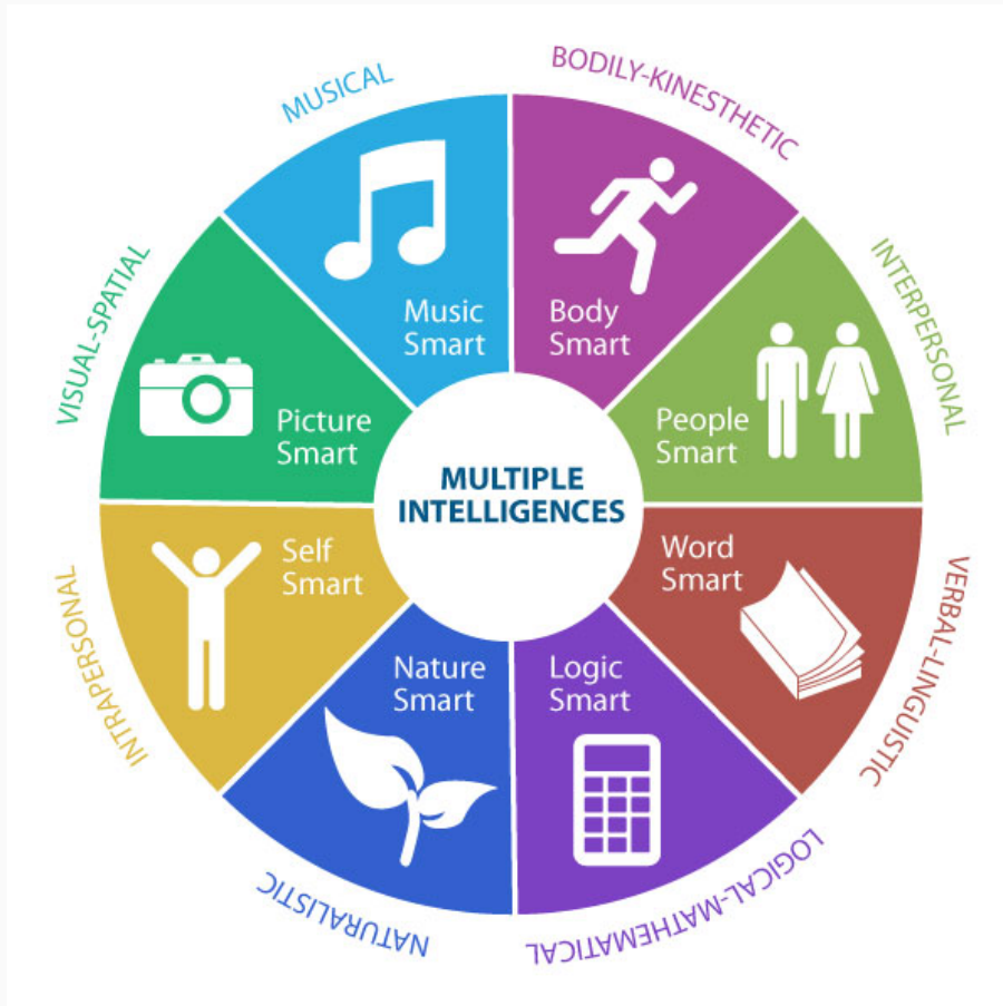
Figure 2. Multiple intelligences theory proposed by Gardner.