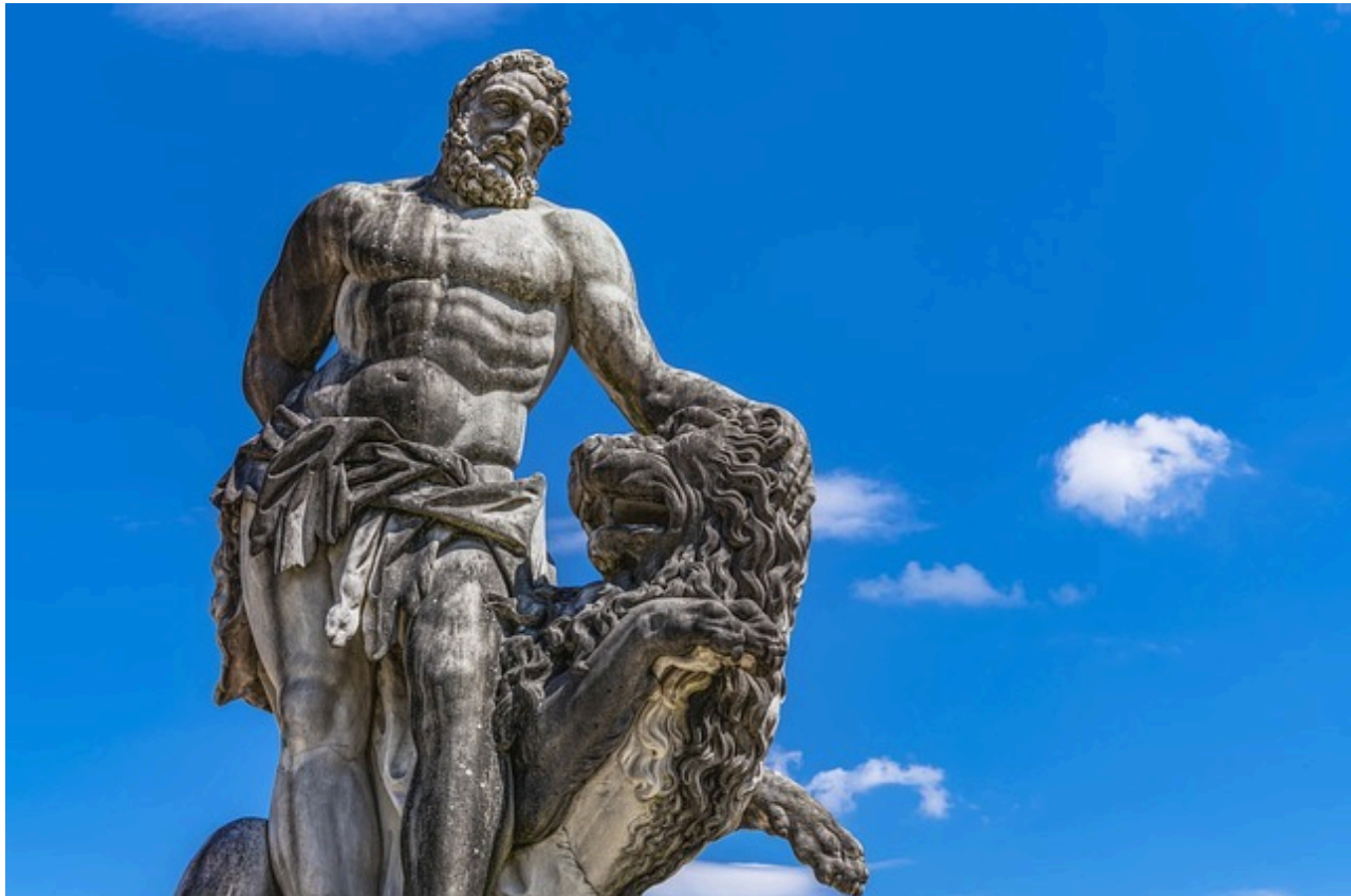
Literature Reviews can help you develop rock hard research abs.

And by strengthening your ability to evaluate and synthesize sources, you'll actually strengthen your other writing skills as well, including your traditional research paper writing skills. You'll find after you focus on the literature review that finding and evaluating any type of source will be much easier—just like strengthening your core muscles will help you with all types of exercise.