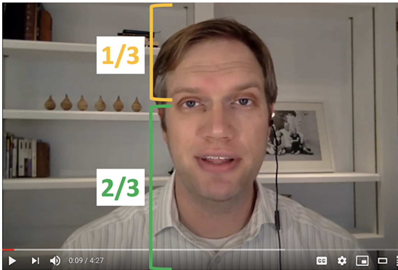
Figure 5. Establishing an optimal vertical relationship of face and camera