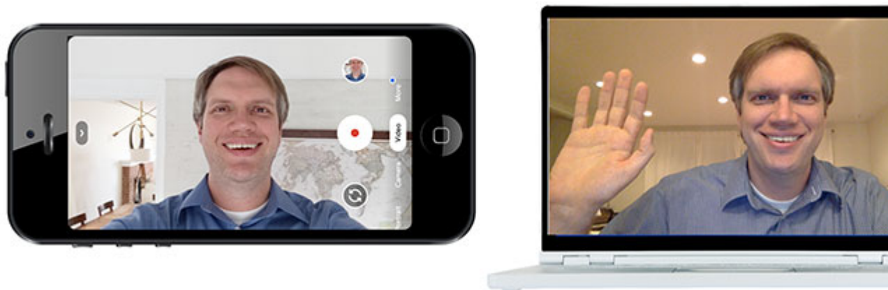
Figure 2. Jered Borup's video products