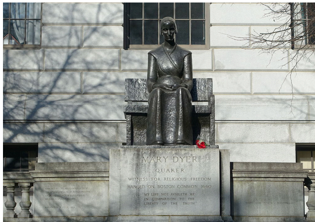
Mary Dyer Statue Outside the Massachusetts State House, Boston, Massachusetts

In 1638, following a trial as a heretic, she was banished to Rhode Island on charges of blasphemy and sedition. She later moved to the colony of New Netherlands (now New York) and was killed during an Indian raid. Learn more from the National Women's History Museum's Biography of Anne Hutchinson .