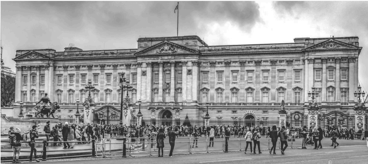
Buckingham Palace

In early 2021, Oprah Winfrey's much-anticipated interview with (Prince) Harry and Meghan Markle aired on television in Great Britain and the United States, creating a huge media event. Online and print media devoted extensive coverage to stories of palace intrigue and family conflict, including revelations about racism within the royal family. The interview followed Harry's and Meghan's break with the royal family in which they voluntarily gave up their royal duties and their His/Her Highness titles.