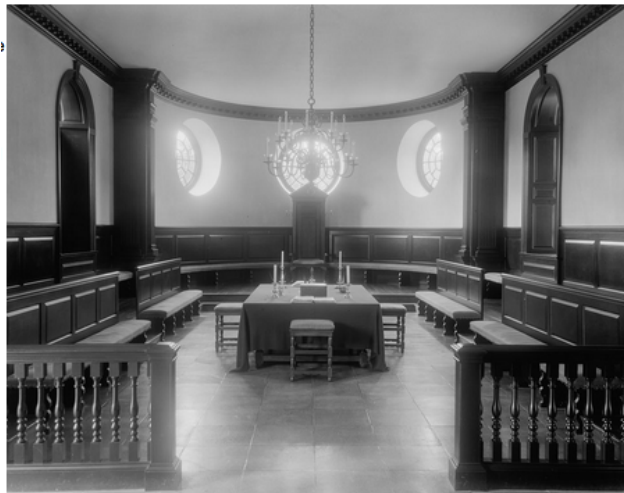
Photo of " Interior of the Virginia House of Burgesses " by Frances Benjamin Johnston , Public Domain

The Virginia House of Burgesses was the first legislative assembly in the American colonies. The assembly met for the first time in Jamestown's church on July 30, 1619. It had 23 original members, including the colony's governor, all of whom were property-owning white men. It was modeled after the British Parliament and members met annually to vote on taxation and set local laws. You can learn more from Social Studies for Kids: The Virginia House of Burgesses .