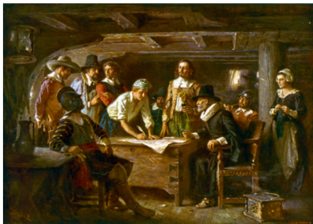
Signing of the Mayflower Compact, 1620

Signed in 1620 by 41 adult male passengers during the 3000-mile sea voyage from Holland to establish a colony in the new world of North America, the Mayflower Compact established a framework for self-government among the colonists.