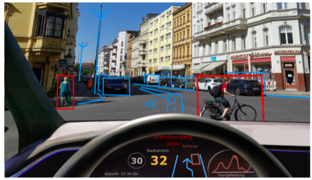
"<u>Picturization of self driving car from drivers perspective, active breaking and obstacle reconnaissance</u>"

Automobiles are at the center of life in the United States. In 2021, it was estimated that there are some 290.8 million cars, trucks, and buses on U.S. roads and highways. But the types of vehicles are changing with the arrival of electric vehicles (EVs). In 2022, General Motors announced it will make all Buick models electric by 2030, beginning with an electric crossover SUV in 2024.