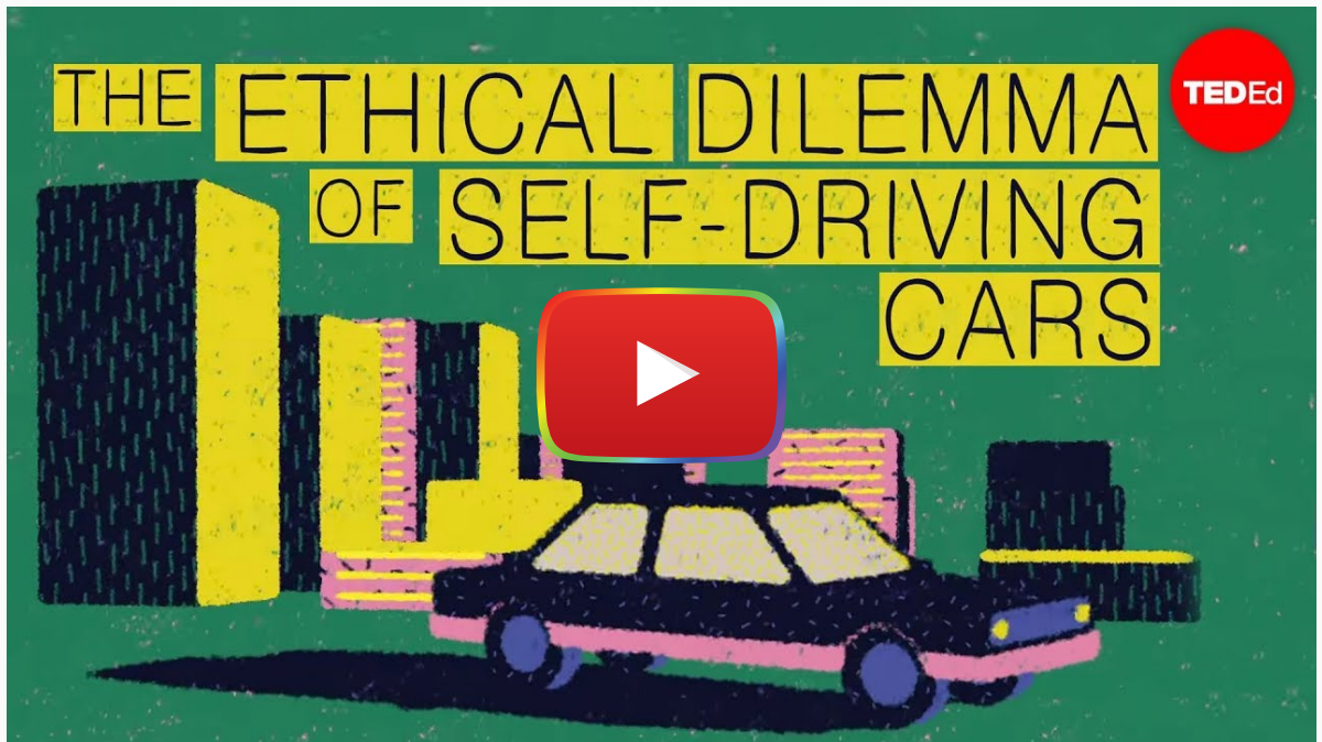
Watch on YouTube

• Activity: Who Should Regulate Self-Driving Cars?