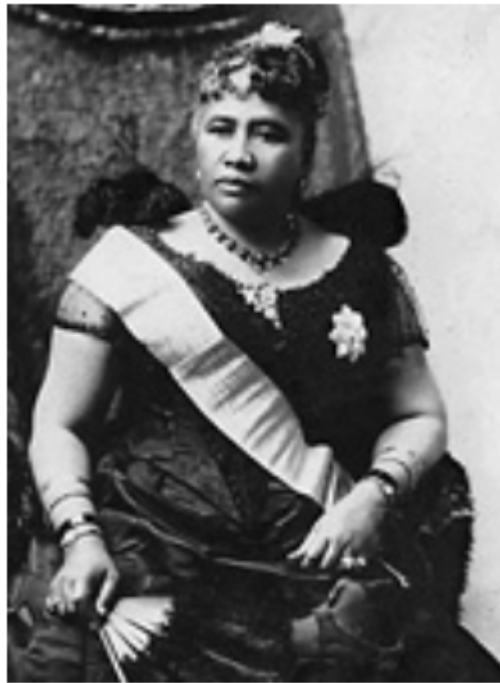
Queen Liliuokalani was the last Monarch of Hawaii "Liliuokalani sitting on chair draped with feather cloak"