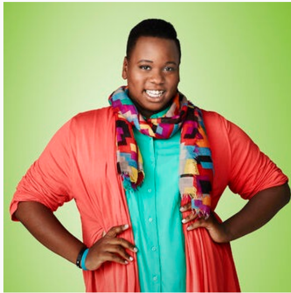
"Unique Adams" is licensed under CC-BY-SA

What role might the media play in influencing how transgender students are treated by others?