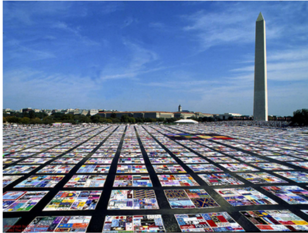
Picture of the AIDS quilt in front of the Washington Monument "Aids Quilt"

Throughout our history, individuals and groups who have not had those rights have organized to gain them. African Americans, Latinos/Latinas, Native Americans, Asian/Pacific Islanders, women, workers, disabled individuals, and LGBTQIA people have struggled and fought for their liberties and freedoms as citizens of the United States.