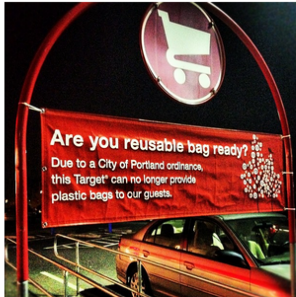
Portland, Oregon Plastic Bag Ordinance