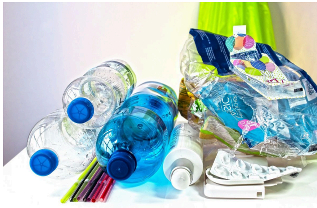
Plastic Waste

Climate experts, including the 2018 United Nations Intergovernmental Panel on Climate Change , agree that urgent governmental action—nationally, internationally, and locally—is needed to try and reverse the effects of human impact on the environment .