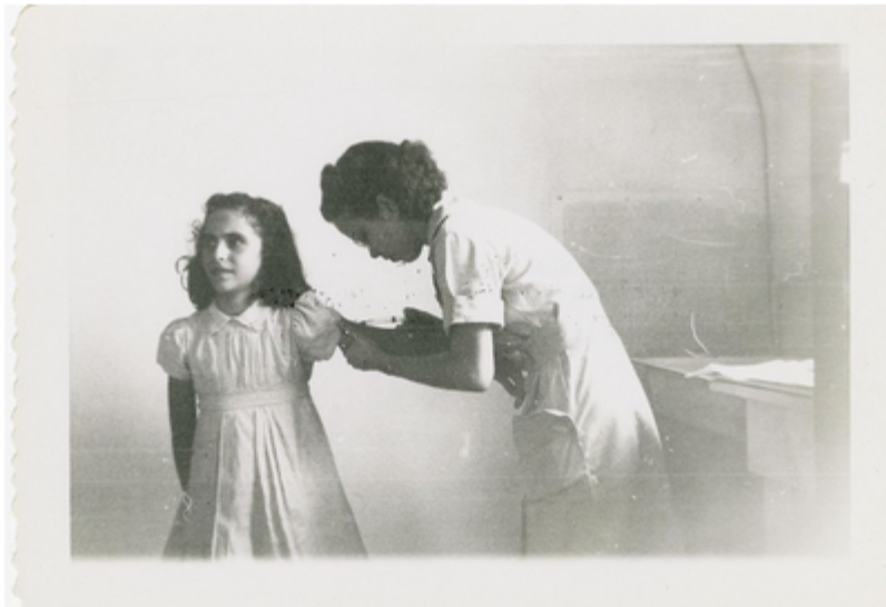
Nurse immunizing young girl in dress in the 1930s

In 1809, the town of Milton became the first Massachusetts community to offer free smallpox vaccinations. The town of Milton's action was followed that same year by a state law requiring smallpox vaccination, making Massachusetts the first state in the nation to promote the use of vaccination as a public health policy. Since then, advances in medical science have enabled physicians to use vaccinations to treat previously incurable diseases, including Avian Cholera (1879); Rabies (1885); Polio (1955); Measles (1963), and Mumps (1967) ( Vaccine History: Developments by Year , Children's Hospital of Philadelphia).