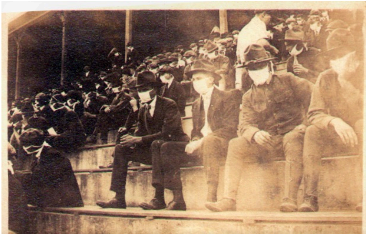
Georgia Tech football game 1918 during Spanish Flu

Requiring mask wearing during public health emergencies has long been a highly contested government policy. During the 1918-1919 influenza pandemic, there were mask-wearing ordinances, particularly in states in the western part of the United States, including the cities of San Francisco, Seattle, Oakland, Sacramento, Denver, Indianapolis, and Pasadena. Masks were of poor quality by today's standards; people wore gauze or other similarly light fabrics (learn more: The Flu in San Francisco from PBS American Experience).