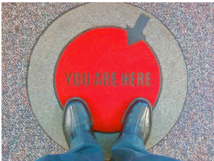
Know where you are so you can know where you're going.

Here you are in a class about Advanced Writing. Are you wondering what you're doing here? What's the point of this class? Is it just another hoop to jump through before graduating? Didn't you already take a writing class as a freshman? Haven't you already learned how to write papers in your other classes? Isn't that good enough?