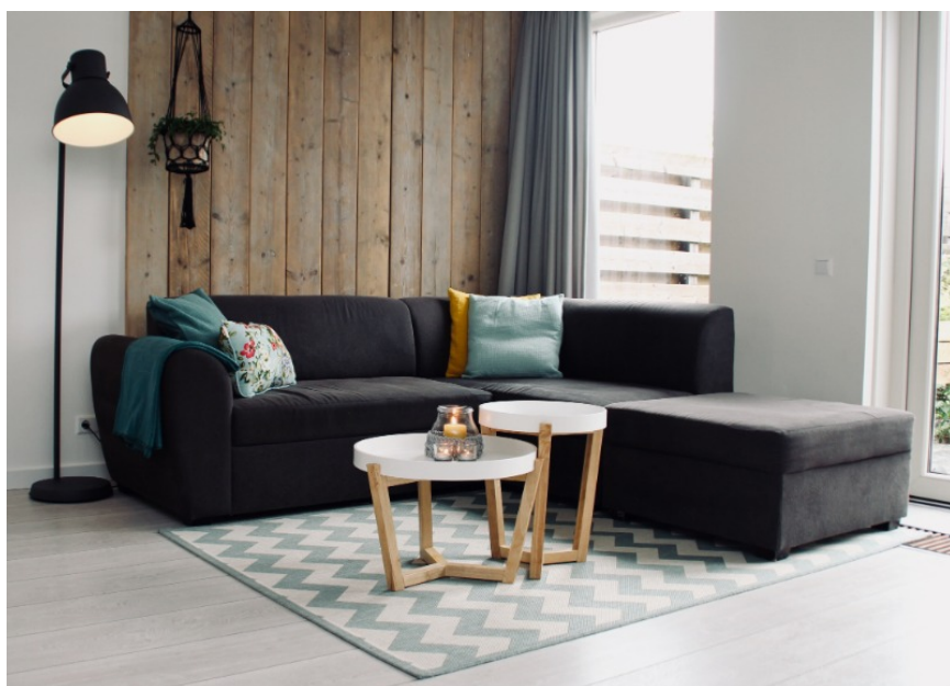
This parlor is preferred by hipsters.

A famous scholar named Kenneth Burke (okay, famous mostly just to writing teacher nerds) came up with an equally famous analogy for academic writing (also mostly writing-teacher famous, but still awesome). Note: It helps if you imagine Morgan Freeman's voice reading it. He said,