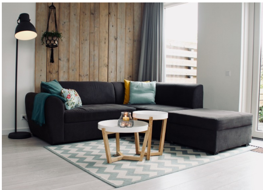
This parlor is preferred by hipsters.