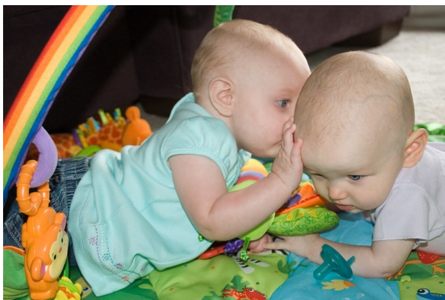
Secret: Even babies know how important communication is.

Let me tell you a secret: you will spend most of your life communicating. Even those of you who chose your college major thinking that you wouldn't have to write a lot (math majors, anyone?) will spend most of your work life communicating—reading, speaking, and writing. Trust me; you might not believe it now, but go talk to someone who has the job you want someday, and you'll find out just how much of their work life involves communication. (Spoiler alert: it's a lot.)