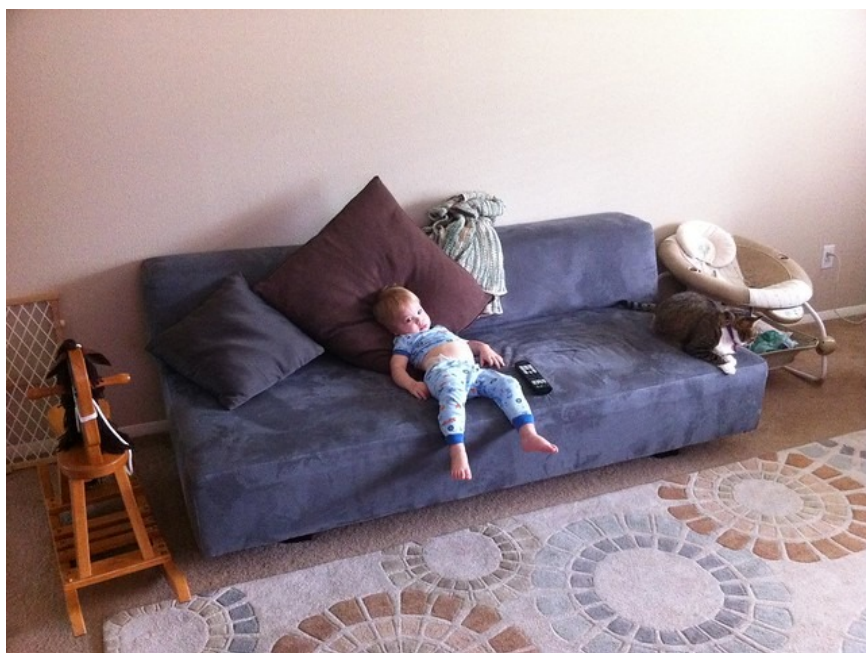
Is this your Writing Spirit Baby?

But wouldn't it be amazing if your words could actually change people's minds? (Like your boss's mind about that raise?) What about changing people's lives? What if you could not only find answers to real-life problems but also share your work with others so they make a difference in the world? Or what if you just want to express yourself better to that cute student across the room? Or what if you want to convince your city to move a walking path that juts into your property because you want to install a fence and you don't have the tools or permission to move it? (This may or may not be based on a real life example from my backyard.) All of these things and more can be yours if you learn how to up your game as a communicator. And that takes practice—thus, this class.