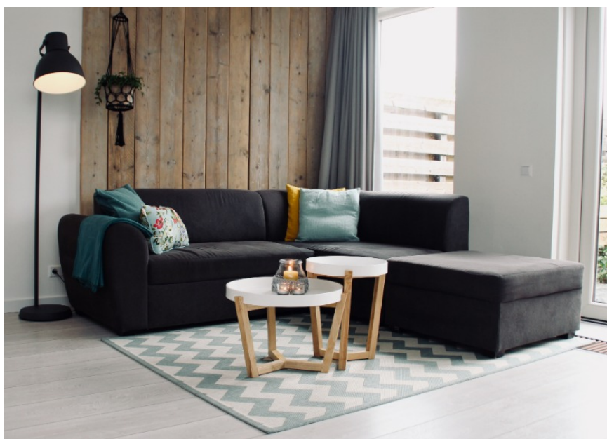
This parlor is preferred by hipsters.

A famous scholar named Kenneth Burke (okay, famous mostly just to writing teacher nerds) came up with an equally famous analogy for academic writing (also mostly writing-teacher famous, but still awesome). Note: It helps if you imagine Morgan Freeman's voice reading it. He said,