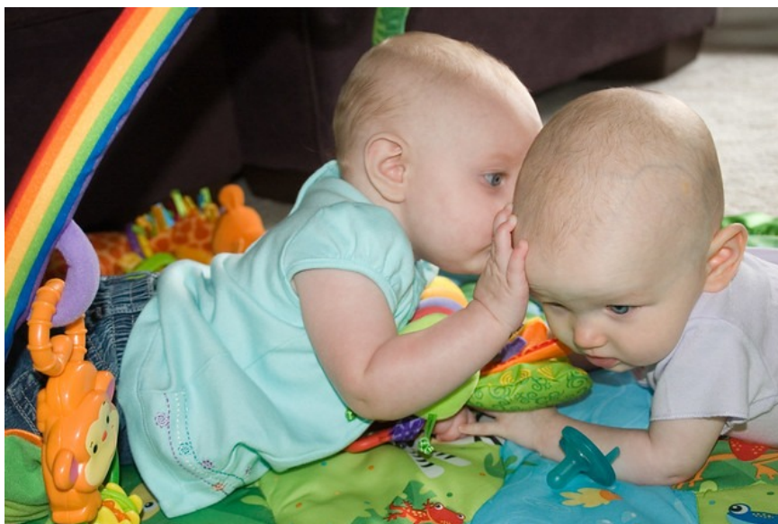
Secret: Even babies know how important communication is.

Let me tell you a secret: you will spend most of your life communicating. Even those of you who chose your college major thinking that you wouldn't have to write a lot (math majors, anyone?) will spend most of your work life communicating—reading, speaking, and writing. Trust me; you might not believe it now, but go talk to someone who has the job you want someday, and you'll find out just how much of their work life involves communication. (Spoiler alert: it's a lot.)