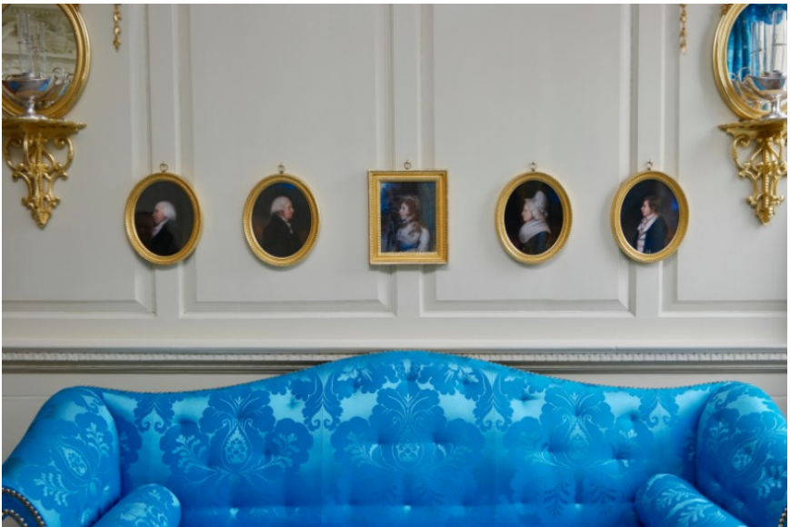
This is actually George Washington's Parlor.

Now that we've established that you're in the right place, let me tell you what your job is in this class. I know, I know, you're going to say your job is "to learn." And you're not wrong. But more specifically, we want to teach you how to join a conversation. And not just any conversation, but the particular conversation in your field. That's what makes this writing class an "advanced writing" class as opposed to your first-year writing class or high school. Your first-year writing class was all about writing skills in general, but this one focuses on your field of study and the specific vocabulary, strategies, and tools your future colleagues use. To explain this, first, let me set the mood. (Feel free to turn down the lights for this section.) Welcome to my parlor: