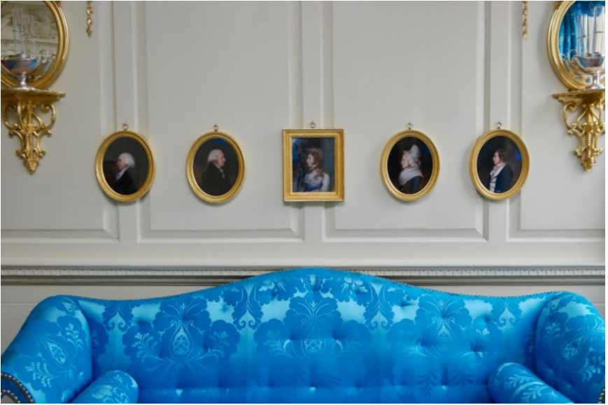
This is actually George Washington's Parlor.

Or if you prefer this modern parlor . . .