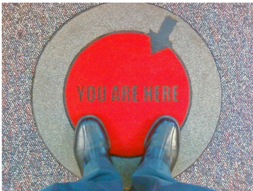
Know where you are so you can know where you're going.

Here you are in a class about Advanced Writing. Are you wondering what you're doing here? What's the point of this class? Is it just another hoop to jump through before graduating? Didn't you already take a writing class as a freshman? Haven't you already learned how to write papers in your other classes? Isn't that good enough?