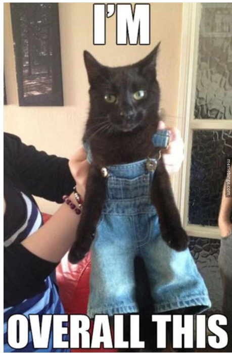
Ah, Cat Memes! They're communication, too.

Well, I have news for you: you still can't avoid communication from your couch. In fact, everything on that screen involves some form of communication—that movie was written and produced by people for people. That video game, too. Even that cat meme you're chuckling at was created by a person to make an impact. And the minute you click "share," presto! You're communicating right back. You can't help it. Because you're human (I'm assuming you're human), and that's what humans do. In fact, you might even say that communication is one of the main things that make us human.