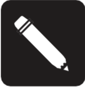
Illustration of Concept