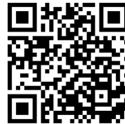
Pinnegar, S. E. (2019). Foundations of Bilingual