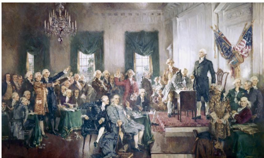
"Scene at the Signing of the Constitution of the United States"

by Howard Chandler Christy | Public Domain