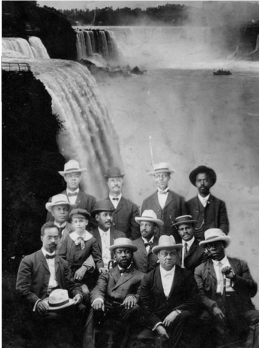
W.E.B. DuBois is in the second row at this Niagara movement meeting in Fort Erie, Canada, 1905

The NAACP set forth a belief in using nonviolent protests and legal actions as the most effective way to achieve full and equal rights for African Americans. In the 1950s and 1960s, civil rights leader Dr. Martin Luther King, Jr. led the practice of nonviolent resistance against segregation and discrimination faced by African Americans in the United States.