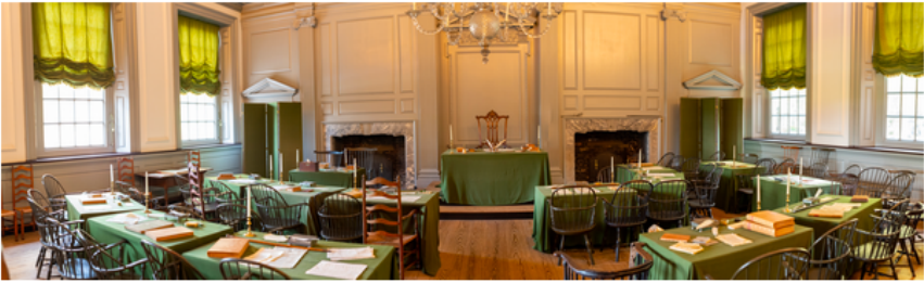
"Assembly Room, Independence Hall, Aug 2019"