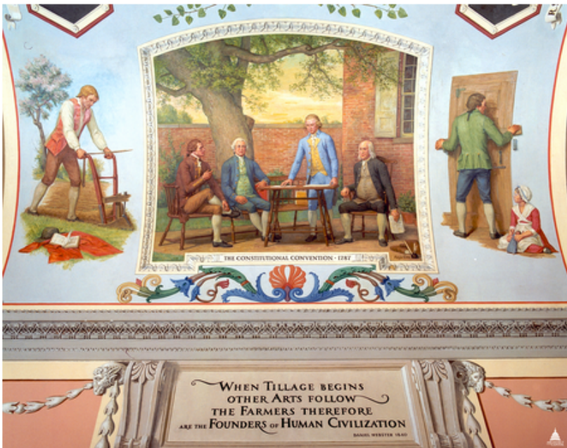
Mural of the Constitutional Convention at the United States Capitol "The Constitutional Convention, 1787" | Public Domain

On May 25, 1787, 55 delegates from every state except Rhode Island arrived at the Pennsylvania State House in Philadelphia to begin the Constitutional Convention . Ranging in age from 26 (New Jersey's Jonathan Dayton) to 81 (Pennsylvania's Benjamin Franklin), the delegates met from May to September and debated the structure of the new government, representation in Congress, the rights of individuals, and the issue of slavery and its future. The compromises they made have continued to dramatically impact the nation's history to the present day.