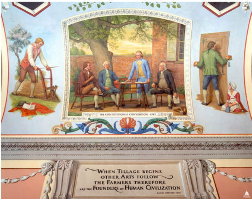
Mural of the Constitutional Convention at the United States Capitol "The Constitutional Convention, 1787"

On May 25, 1787, 55 delegates from every state except Rhode Island arrived at the Pennsylvania State House in Philadelphia to begin the Constitutional Convention . Ranging in age from 26 (New Jersey's Jonathan Dayton) to 81 (Pennsylvania's Benjamin Franklin), the delegates met from May to September and debated the structure of the new government, representation in Congress, the rights of individuals, and the issue of slavery and its future. The compromises they made have continued to dramatically impact the nation's history to the present day.