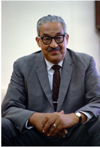
"Thurgood Marshall, 1967"

stated that the Constitution was “defective from the start.”