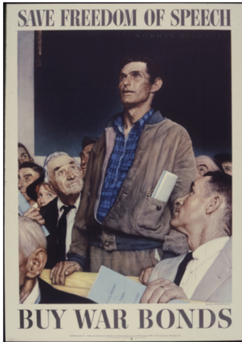
"Save Freedom Speech" by Norman Rockwell (created between 1941 and 1945) Public Domain

The idea that a single individual can contact their elected senator or representative to influence and change public policy is part of how many people think American government should work. The Constitution's First Amendment includes the right "to petition the government for a redress of grievances." The image of a highly motivated, civic-minded person making a difference (like the speaker in Norman Rockwell's famous Freedom of Speech painting ) is deeply ingrained in popular culture.