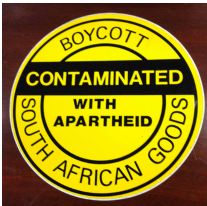
South African Goods Boycott Sign, 1986

For example, a coffee drinker might decide to stop purchasing coffee from one store in protest over that store's actions or policies (boycott) while also deciding to get coffee from only a fair trade store (buycott), even if it meant spending more time and/or money to do so.