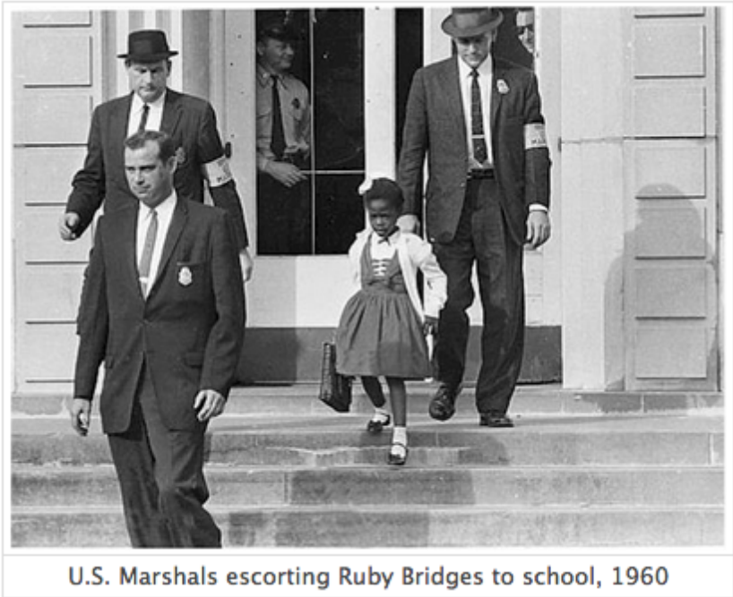
"US Marshals with Young Ruby Bridges on School Steps"

Decades earlier, in 1960, six-year-old Ruby Bridges of New Orleans, Louisiana became the first African American student to integrate into a formerly all-White elementary school in the American South. Four federal marshals escorted her to class every day past crowds of White protestors.