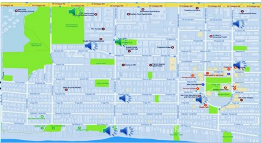
Visual of a map with linked sound effects

Preparing her presentation notes for a Town Hall provided the opportunity to