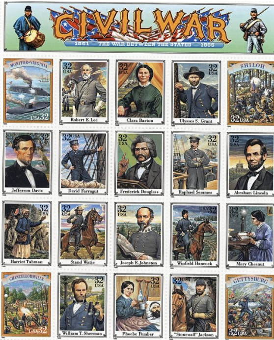
A sheet of US 32-cent postage stamps commemorating the American Civil War/War Between the States

To understand the present, it is important to understand the past, and the activities in this section explore different dimensions of the Civil War and its impacts on civil rights through the lens of newspapers and advertisements.