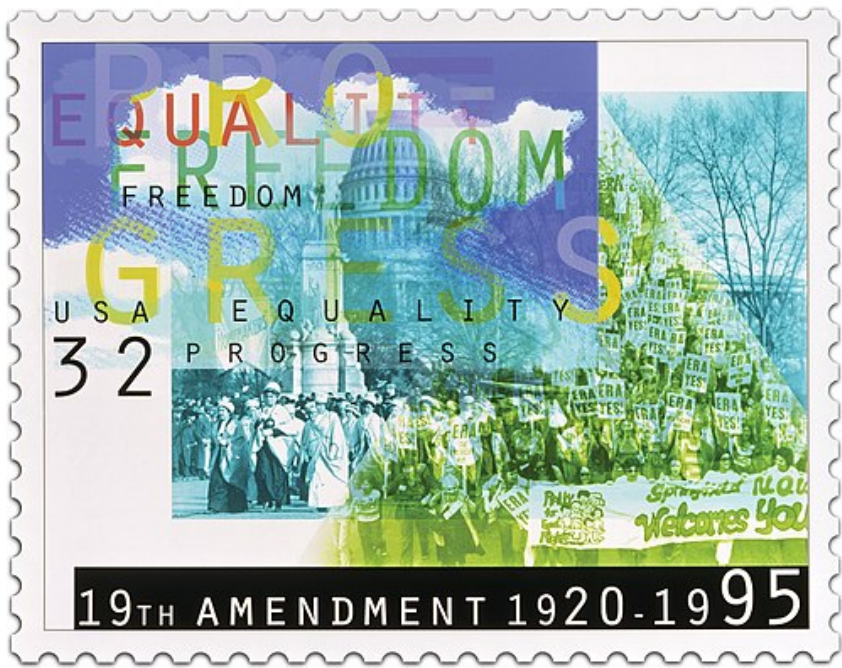
19th Amendment Commemorative Postage Stamp by MadeInSpace.la is licensed under CC BY SA 4.0

The media literacy activities in this section explore the Prohibition era in U.S. history, efforts to pass the Equal Rights Amendment and the Equality Act, how the Civil War is presented in historical publications, how race and gender are represented on U.S. currency, the importance of reading aloud Supreme Court dissents, and the potential impacts of cameras in federal and state courtrooms.