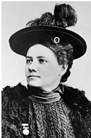
Nellie Bly

Investigative journalists have helped to create social and political change throughout history from improving worker conditions in the early 1900s (the early muckrakers' work of Ida Tarbell, Ida B. Wells, Upton Sinclair, and others) to releasing the Pentagon Papers (Daniel Ellsberg; 1971), exposing sexual harassment in the 2010s (#MeToo), and uncovering the workings of the January 6, 2021 Insurrection at the U.S. Capitol.