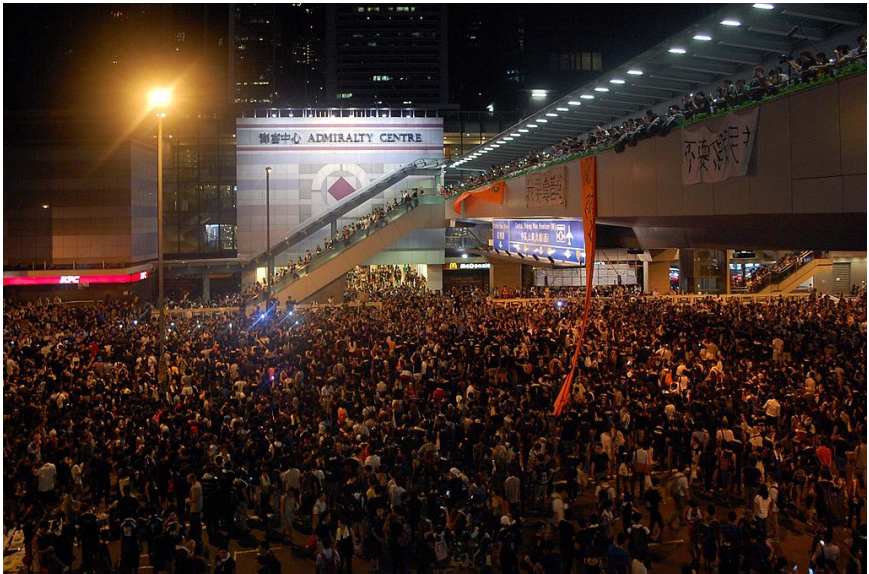
"Hong Kong protest Admiralty Centre"