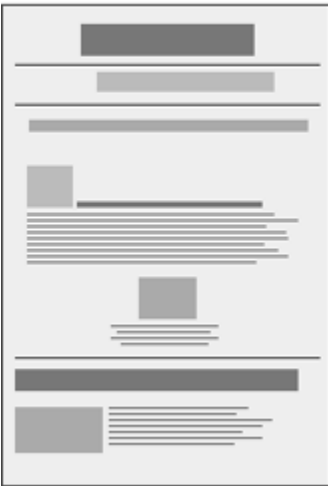
Poor page layout; no visual hierarchy