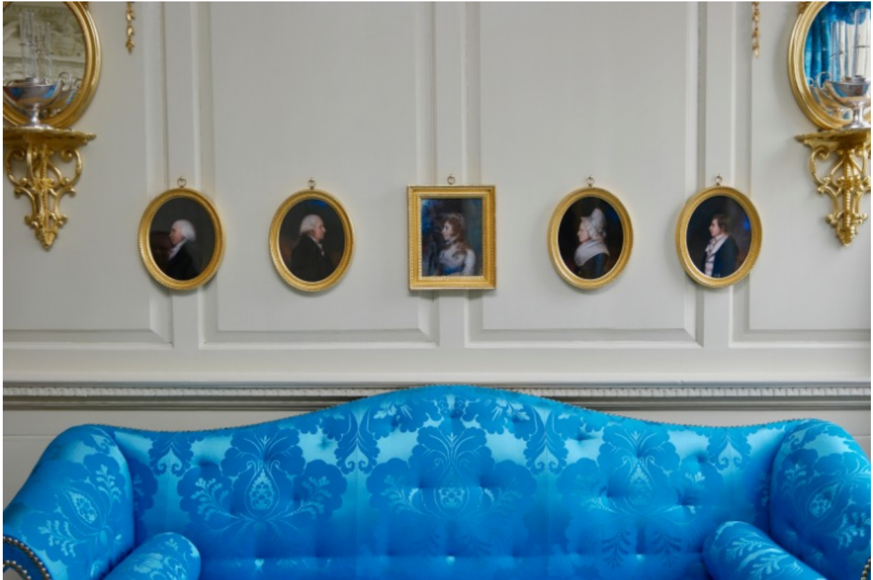
This is actually George Washington's Parlor.

opposed to your first-year writing class or high school. Your first-year writing class was all about writing skills in general, but this one focuses on your field of study and the specific vocabulary, strategies, and tools your future colleagues use. To explain this, first, let me set the mood. (Feel free to turn down the lights for this section.) Welcome to my parlor: