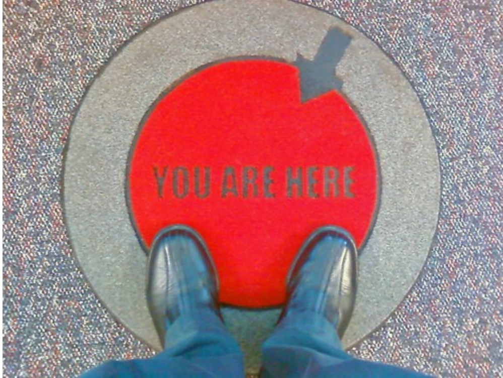
Know where you are so you can know where you're going.

Here you are in a class about Advanced Writing. Are you wondering what you're doing here? What's the point of this class? Is it just another hoop to jump through before graduating? Didn't you already take a writing class as a freshman? Haven't you already learned how to write papers in your other classes? Isn't that good enough?