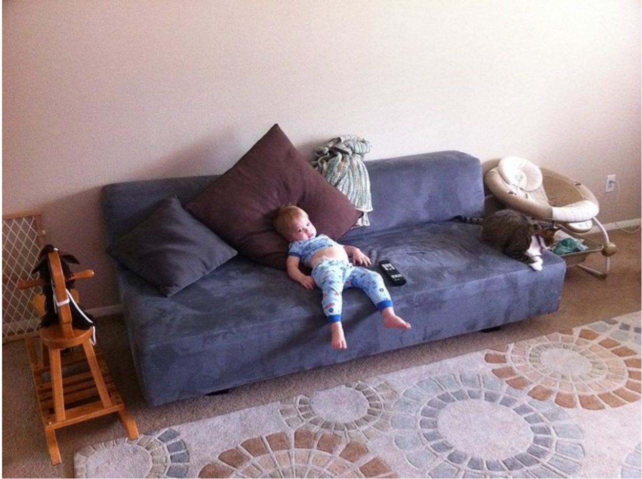
Is this your Writing Spirit Baby?

But wouldn't it be amazing if your words could actually change people's minds? (Like your boss's mind about that raise?) What about changing people's lives? What if you could not only find answers to real-life problems but also share your work with others so they make a difference in the world? Or what if you just want to express yourself better to that cute student across the room? Or what if you want to convince your city to move a walking path that juts into your property because you want to install a fence and you don't have the tools or permission to move it? (This may or may not be based on a real life example from my backyard.) All of these things and more can be yours if you learn how to up your game as a communicator. And that takes practice—thus, this class.