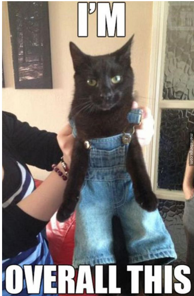
Ah, Cat Memes! They're communication, too.

Well, I have news for you: you still can't avoid communication from your couch. In fact, everything on that screen involves some form of communication—that movie was written and produced by people for people. That video game, too. Even that cat meme you're chuckling at was created by a person to make an impact. And the minute you click "share," presto! You're communicating right back. You can't help it. Because you're human (I'm assuming you're human), and that's what humans do. In fact, you might even say that communication is one of the main things that make us human.