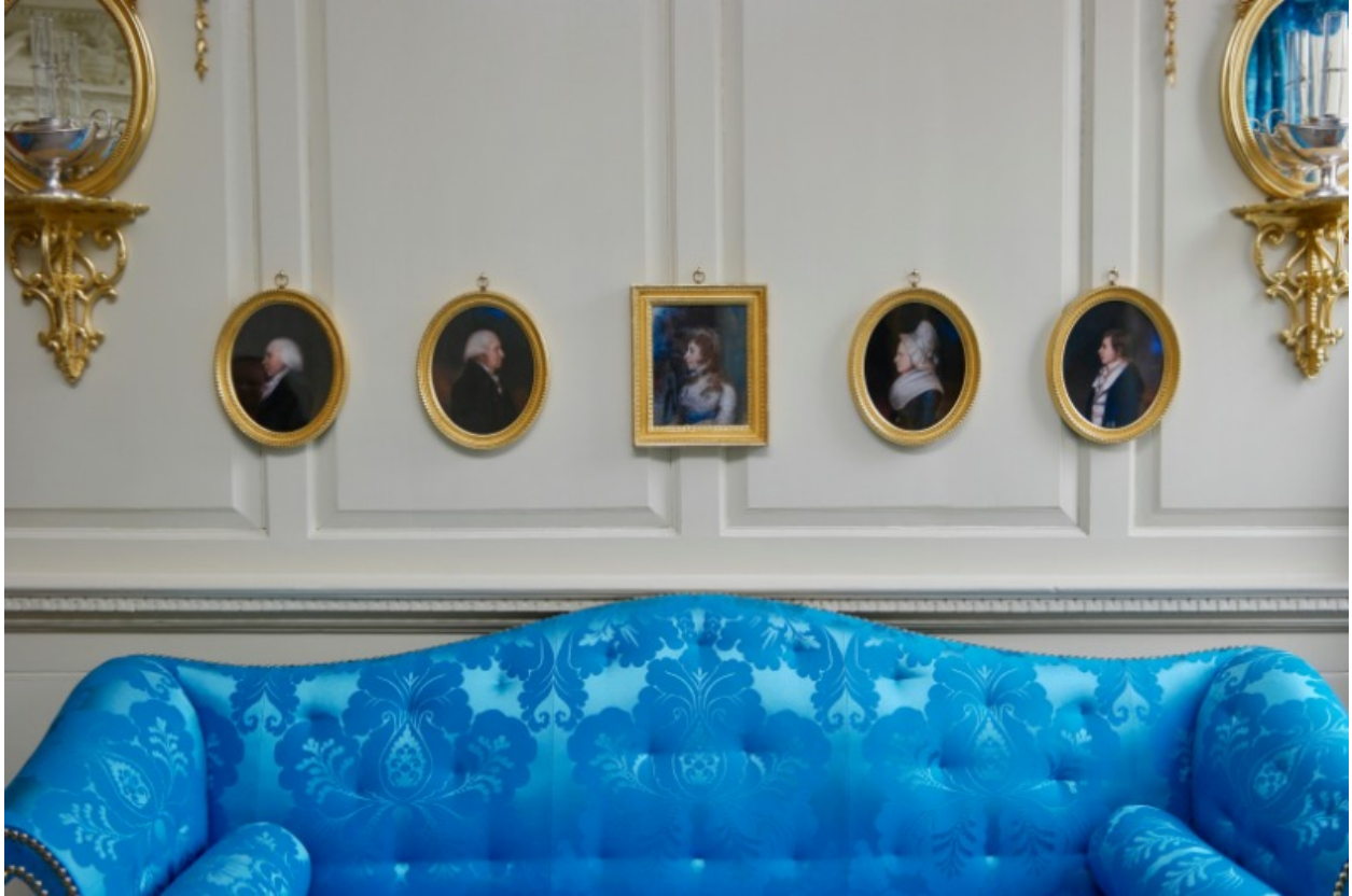
This is actually George Washington's Parlor.

opposed to your first-year writing class or high school. Your first-year writing class was all about writing skills in general, but this one focuses on your field of study and the specific vocabulary, strategies, and tools your future colleagues use. To explain this, first, let me set the mood. (Feel free to turn down the lights for this section.) Welcome to my parlor: