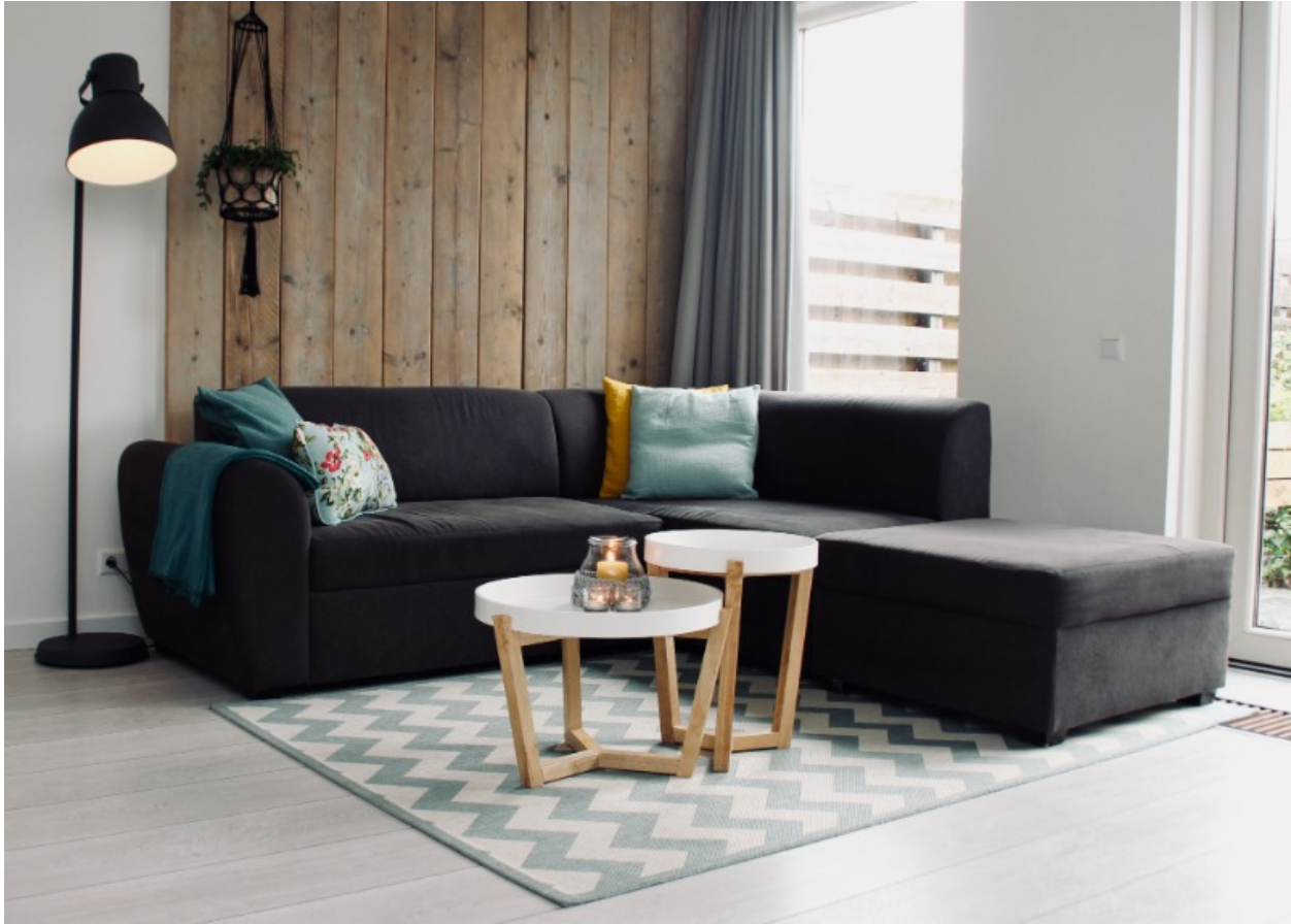
This parlor is preferred by hipsters.

A famous scholar named Kenneth Burke (okay, famous mostly just to writing teacher nerds) came up with an equally famous analogy for academic writing (also mostly writing-teacher famous, but still awesome). Note: It helps if you imagine Morgan Freeman's voice reading it. He said,