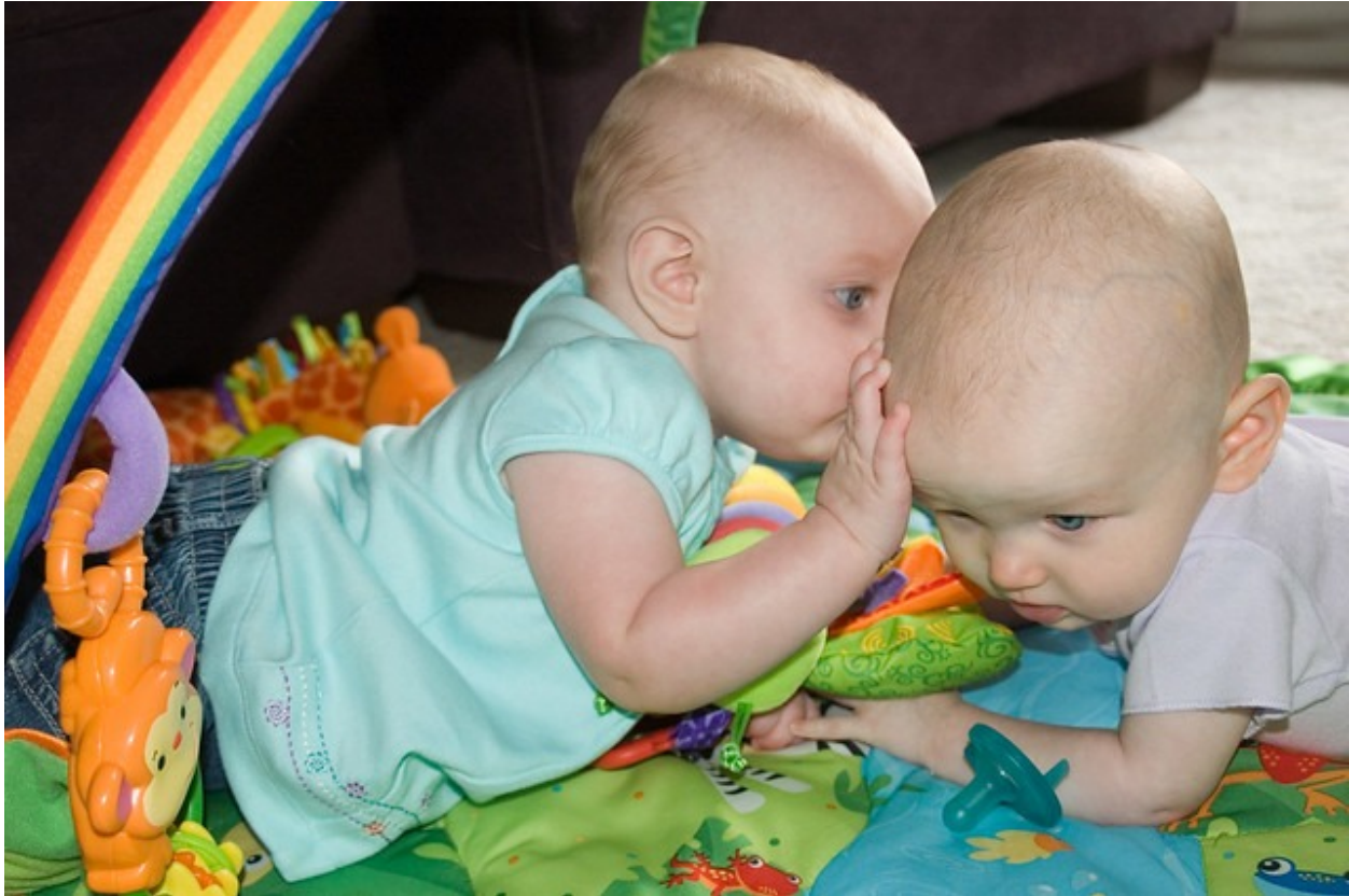
Secret: Even babies know how important communication is.

Let me tell you a secret: you will spend most of your life communicating. Even those of you who chose your college major thinking that you wouldn't have to write a lot (math majors, anyone?) will spend most of your work life communicating—reading, speaking, and writing. Trust me; you might not believe it now, but go talk to someone who has the job you want someday, and you'll find out just how much of their work life involves communication. (Spoiler alert: it's a lot.)