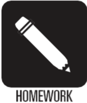
Illustration of Concept