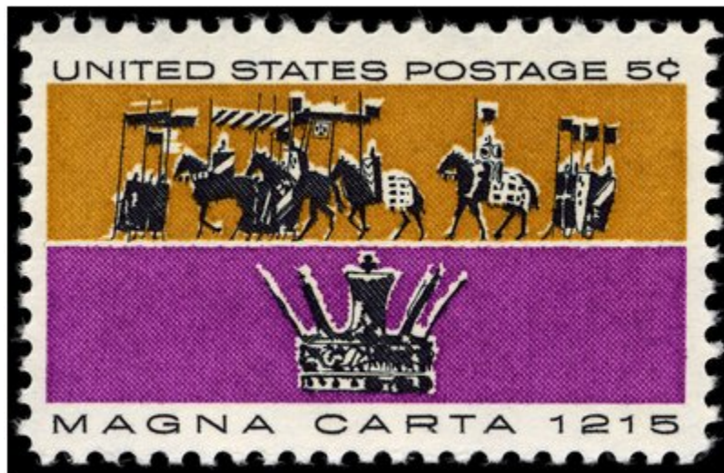
"Magna Carta 5-cent 1965 issue U.S. stamp"

How did experiments in democracy and democratic government that began in the 13 North American colonies connect to modern day United States governmental ideas and practices? The modules in this chapter explore democracy and voting in colonial America, the impact of Anne Hutchinson's religious dissent, and current debates over extending voting rights to 16 and 17-year-olds.