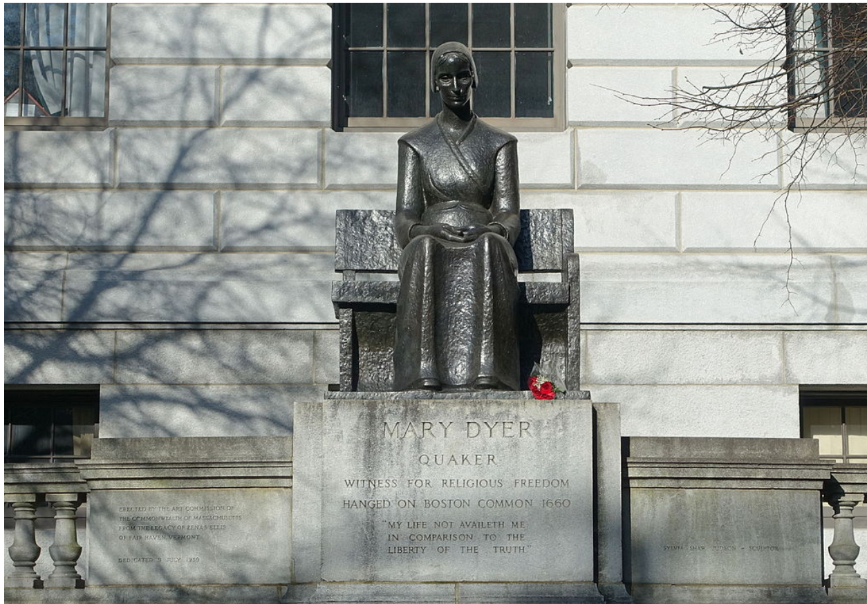
Mary Dyer Statue Outside the Massachusetts State House, Boston, Massachusetts Mary Dyer by Sylvia Shaw Judson