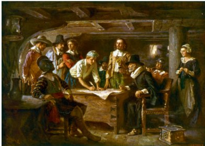
Signing of the Mayflower Compact, 1620

Signed in 1620 by 41 adult male passengers during the 3000-mile sea voyage from Holland to establish a colony in the new world of North America, the Mayflower Compact established a framework for self-government among the colonists.