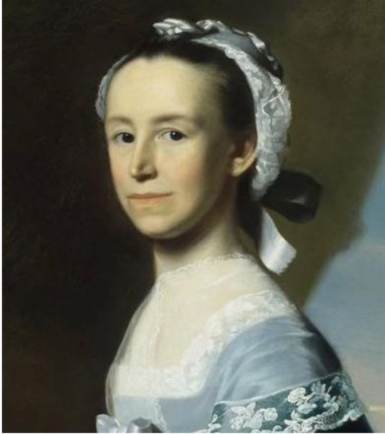
"Portrait of Mercy Otis Warren" by John Singleton Copley