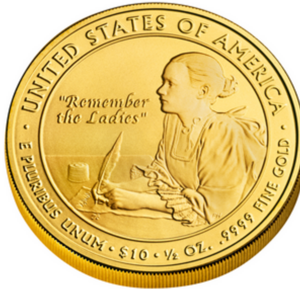
"Abigail Adams 'Remember the Ladies' Coin"

Mercy Otis Warren , from Barnstable and Plymouth Massachusetts, was a poet, playwright, and essayist whose writing was strongly political - a dramatic departure from how women were supposed to behave at the time.