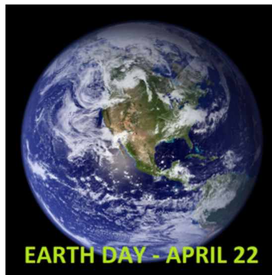
Earth From Space, 2010 "Earth Day - Earth from Space"

The National Park Service was created in 1916. Following the publication of Rachel Carson's seminal book Silent Spring (1962), Congress passed the Clean Air Acts of 1963, 1970 and 1990 along with the Clean Water Act in 1972. There is more historical background and information at a resourcesforhistoryteachers wiki page, The Clean Air Act . Following the first Earth Day (1970), the Environmental Protection Agency (EPA) was established in 1970. As President, Barack Obama took numerous steps to extend environmental protections (Mother Nature Network, 2016).