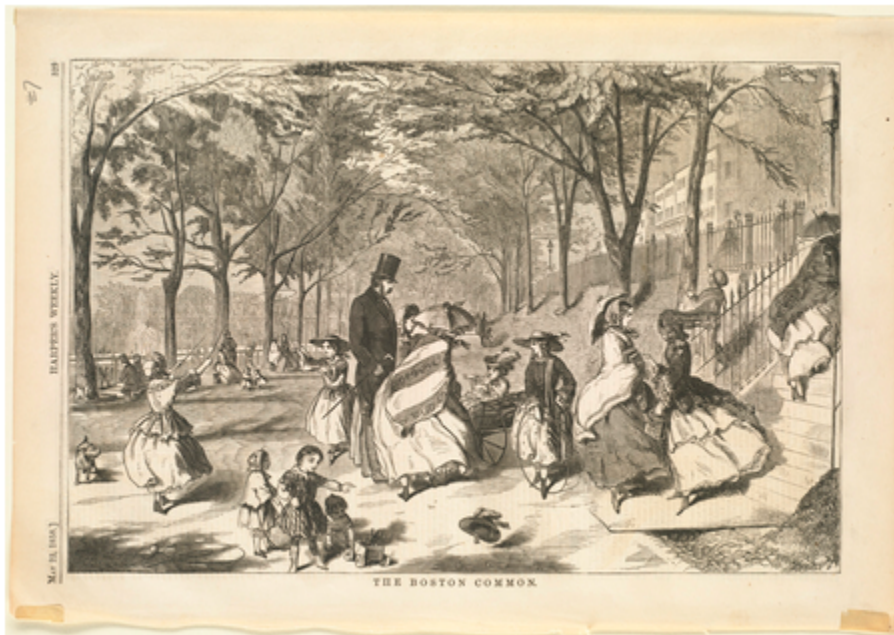
The Boston Common by Winslow Homer, 1858

The structure of Massachusetts government, while similar to that of the federal government, also provides important firsts and key developments (see Table 6.8).