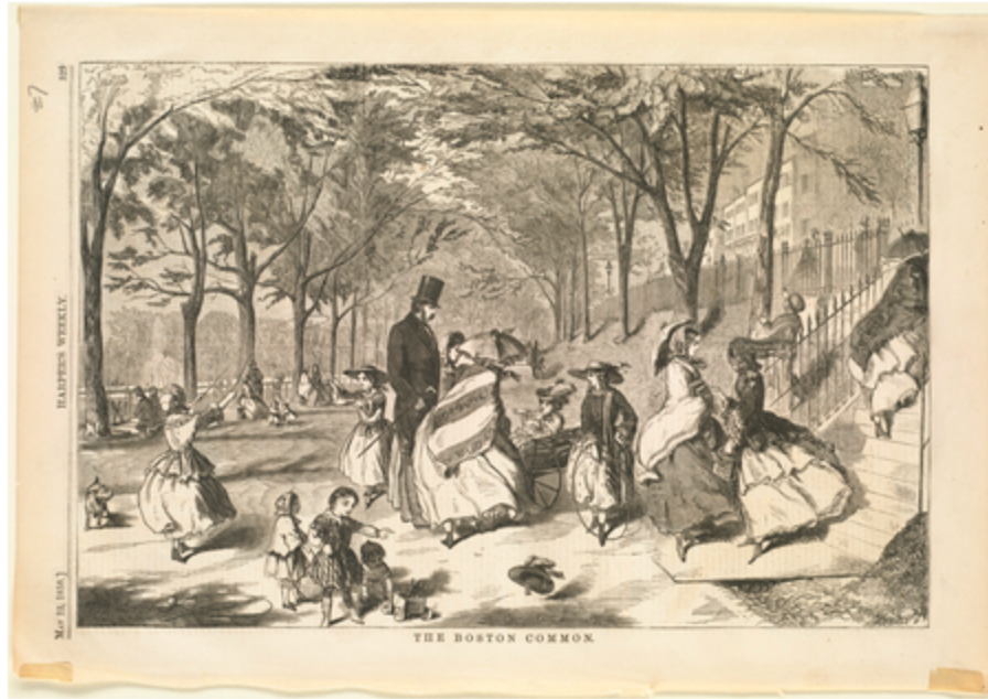
The Boston Common by Winslow Homer, 1858 . Boston Public Library, Public Domain

The structure of Massachusetts government, while similar to that of the federal government, also provides important firsts and key developments (see Table 6.8).