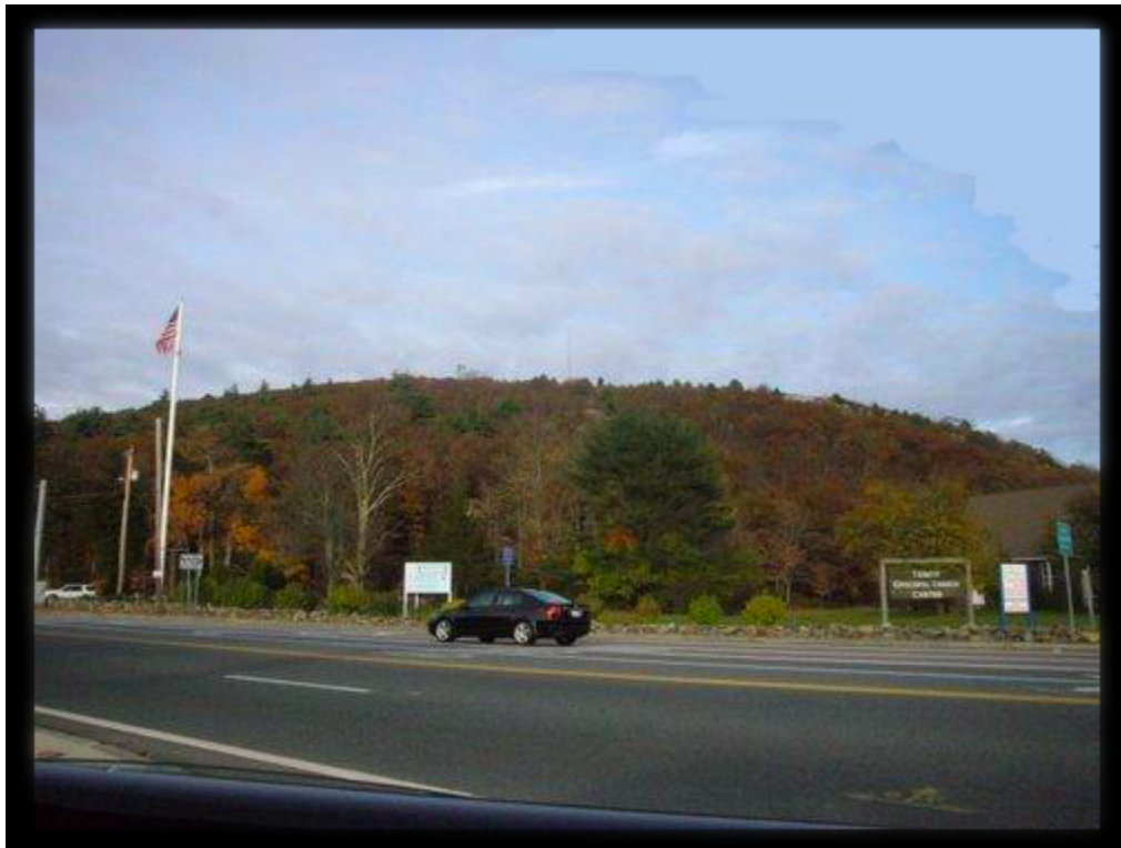
Photo of the Great Blue Hill in Milton, Massachusetts (2009)

Explain the leadership structure of the government of the Commonwealth of Massachusetts and the function of each branch. (Massachusetts Curriculum Framework for History and Social Studies) [8.T6.8]