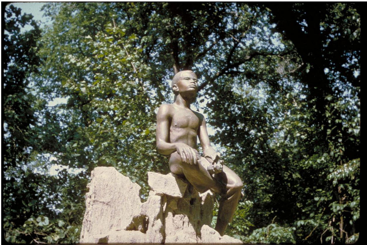
Statue of the young George Washington Carver "George Washington Carver National Monument, Missouri"

Born into slavery in Diamond, Missouri around 1864, George Washington Carver became a world-famous chemist and agricultural researcher. It is said that he single-handedly revolutionized southern agriculture in the United States, including researching more than 300 uses of peanuts, introducing methods of prevent soil depletion, and developing crop rotation methods.