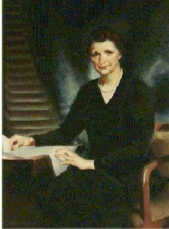
Portrait of Frances Perkins "Frances Perkins"

Francis Perkins was a leader in the passage of the Social Security Act of 1935 that created a national old-age insurance program while also giving support to children, the blind, the unemployed, those needing vocational training, and family health programs. By the end of 2018, the Social Security trust funds totaled nearly $2.9 trillion. There is more information at a resourcesforhistoryteachers wiki page, Frances Perkins and the Social Security Act .