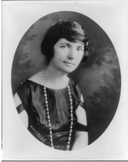
Margaret Sanger (1921)