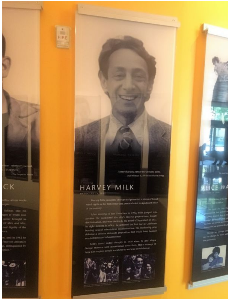
"CA Hall of Fame Harvey Milk Exhibit"

To win that election, Harvey Milk successfully built a coalition of immigrant, elderly, minority, union, gay, and straight voters focused on a message of social justice and political change. He was assassinated after just 11 months in office, becoming a martyr for the gay rights movement. There is more information at a resourcesforhistoryteachers wiki page, Harvey Milk, Gay Civil Rights Leader .