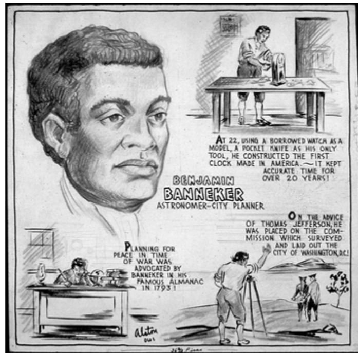
Benjamin Banneker Poster - with Biographical Paragraphs "BENJAMIN BANNEKER - ASTRONOMER-CITY PLANNER" by Charles Henry Alston

Benjamin Banneker was a free Black astronomer, mathematician, surveyor, author, and farmer who was part of the commission which made the original survey of Washington, D.C. in 1791.