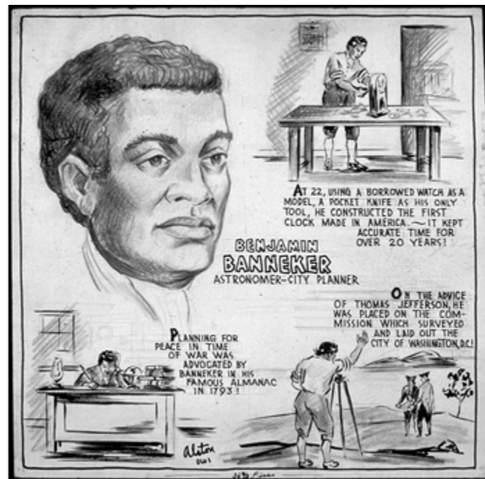
Benjamin Banneker Poster - with Biographical Paragraphs "BENJAMIN BANNEKER - ASTRONOMER-CITY PLANNER" by Charles Henry Alston | Public Domain

Benjamin Banneker was a free Black astronomer, mathematician, surveyor, author, and farmer who was part of the commission which made the original survey of Washington, D.C. in 1791.