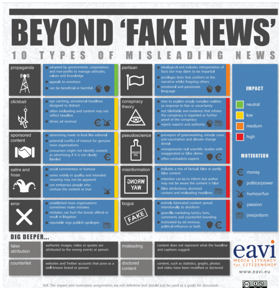
Infographic: Beyond Fake News | CC BY-NC 4.0

affluent, working class) and, in some cases, partisan political perspectives (Democrats, Republicans, progressives, conservatives). The same event is likely to be covered differently by Fox News, MSNBC, The New York Times , and the Washington Post .