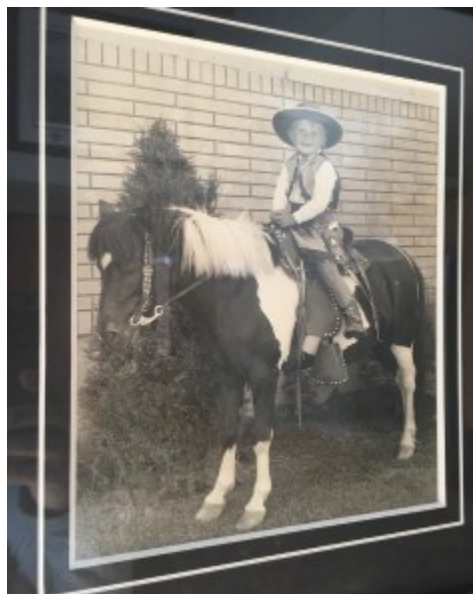
Girl on pony. (Cope Watson, 1961)