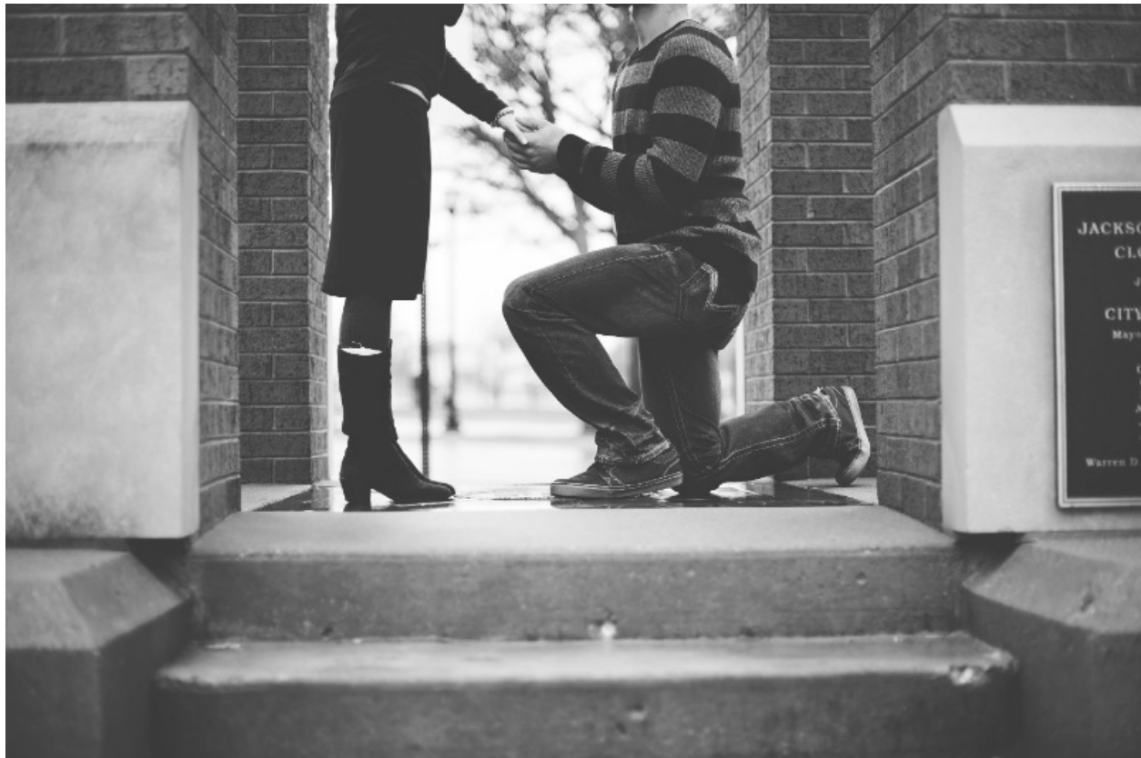
Summary = Love!

Summary is the most felicitous type of citation and the most sophisticated. The reason most students choose not to summarize when citing sources is that summary has the highest degree of difficulty of all the types of source citation—and for good reason: you have to actually understand your source in order to summarize it. You can quote anything you want to without ever understanding what it means, but in a summary, you not only translate the text into your own words, you also shorten its