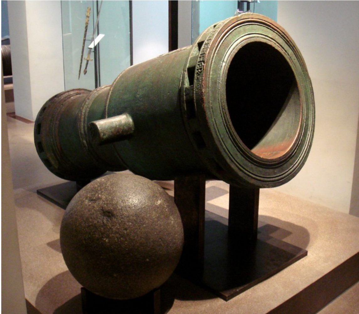
An original bombard—is this what being bombarded with information overload feels like?

We live in a world where we're constantly bombarded by information. We hold in our hands the ability to google any question we can think of and get thousands, if not millions, of answers. Thanks, Siri and Alexa!