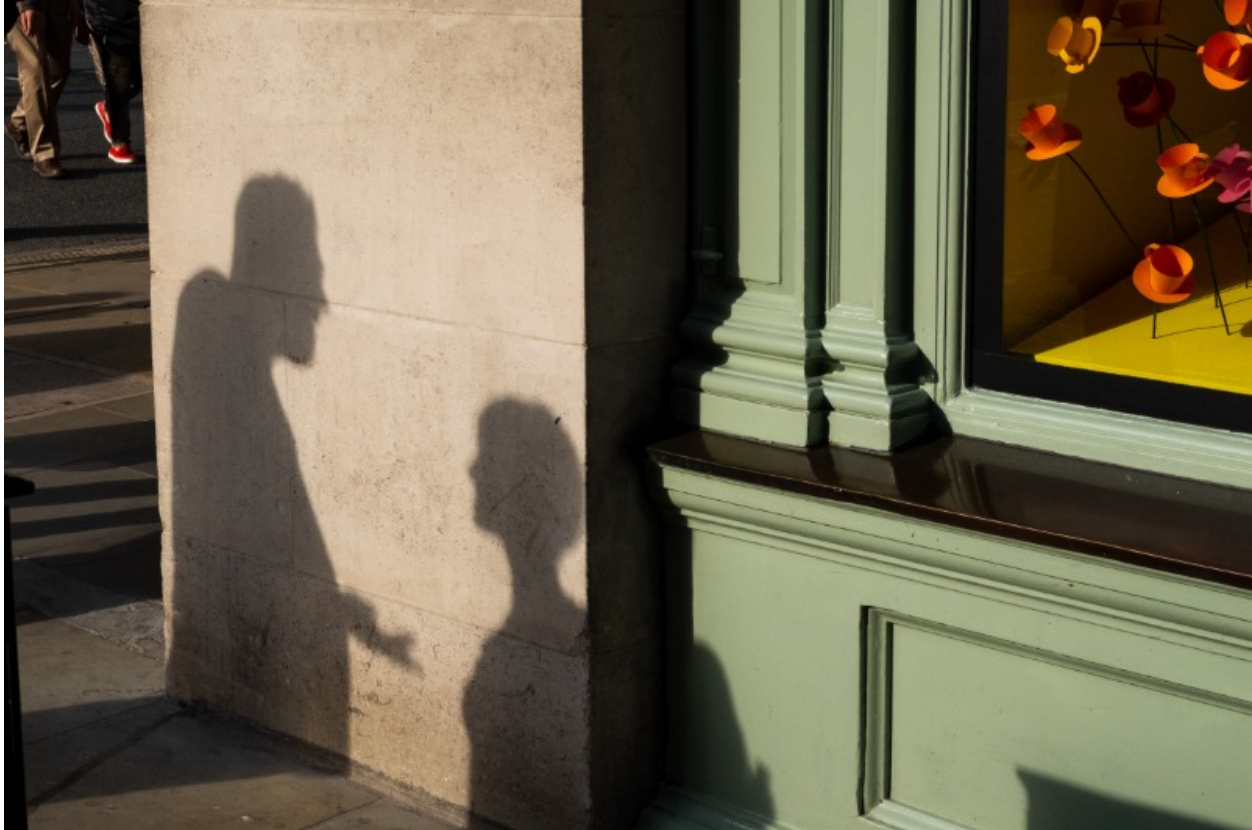
Go away, Patchwriting!

Patchwriting is so 6th Grade. The penguin paper I described above was really an instance of patchwriting. Patchwriting is where a writer—whether intentionally or unintentionally—takes a text, changes some words or substitutes synonyms or changes some grammar but doesn't change it enough to be considered their own words. The degree of difficulty is extremely low because you don't have to understand the text well or even quote well to do it. You can be sloppy. But beware: the consequences can be as dire as if you plagiarize outright.