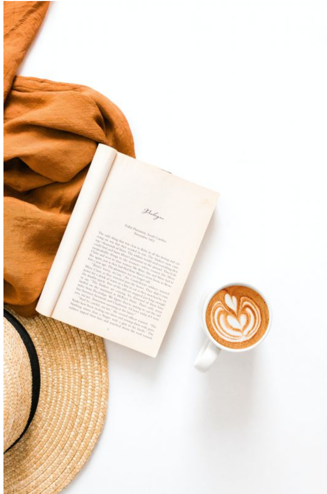
You're not on vacation. If you only cite from the first two pages of a source, you're probably being a lazy researcher.

You read that right. Almost half of all citations came from the first page of the source! If you think about it, the first page usually doesn't contain much more than an abstract and maybe an introductory paragraph or two. So it's not exactly the most meaty part of a paper with the most felicitous quotes.