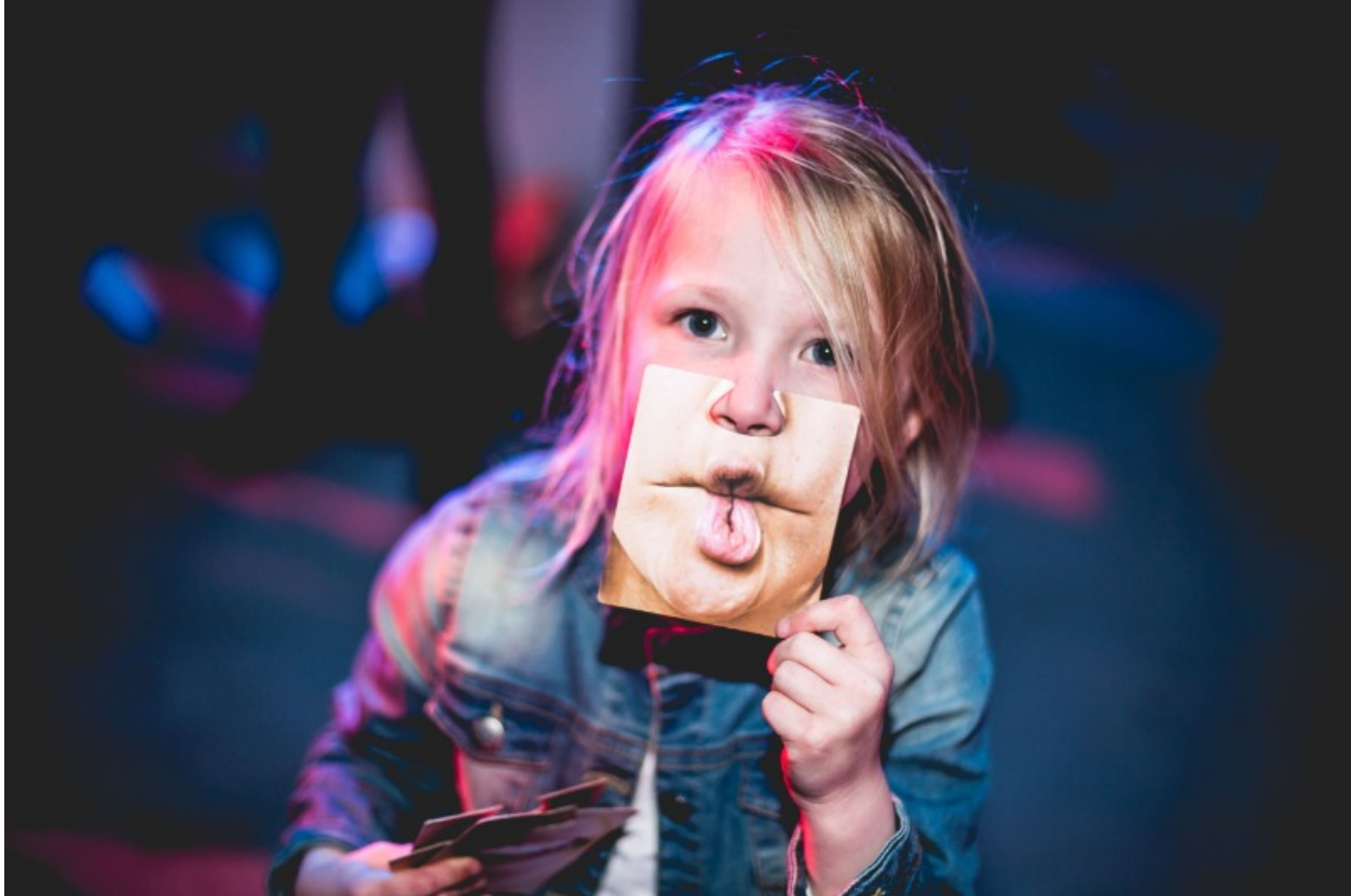
Plagiarism is like taking the words out of someone else's mouth.

So if you want to avoid the dangers of unintentional plagiarism, try not to work sentence-by-sentence and stick as much as you can to summary (oh, Summary, you're so beautiful!). But there are definitely times you'll need to paraphrase, so here's Howard and Jamieson's definition of paraphrase to make things more precise: