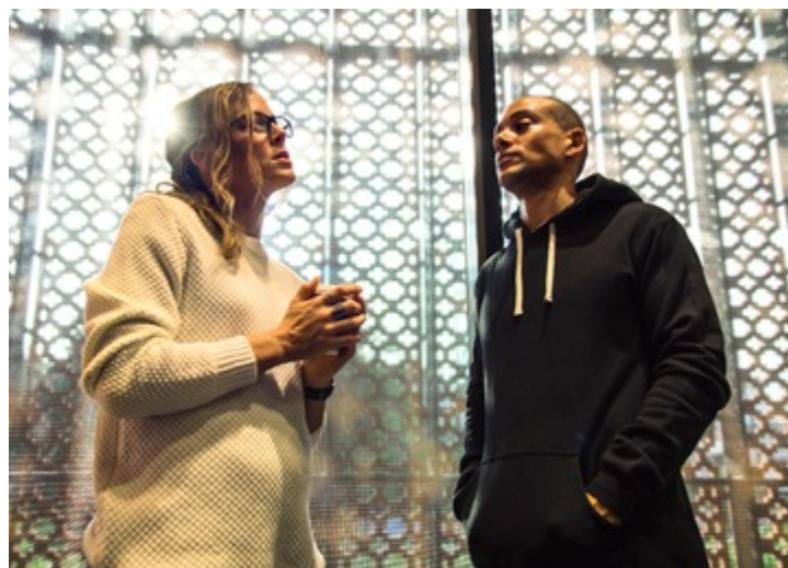
Quotations should stay in the Friend Zone.

So put quotations in the Friend Zone and hang out with them only occasionally. Save your quotes for those times when an author says something in a unique or special way and you want to highlight their language. Or if you want to highlight an expert's authority, you can include a poignant quote. Again, with quotes, you're working sentence-by-sentence, so in order to use them, you don't have to understand the context of a quote or how it fits into the bigger picture. Try to avoid Paparazzi Syndrome—don't take things out of context. It can be all too tempting to find a quote that supports your point without understanding the context or including all sides. Here's Howard and Jamieson's details about quotation: