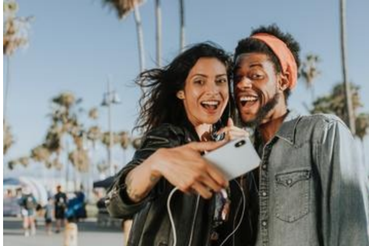
Paraphrase = Like!

When you work sentence-by-sentence, you run the risk of doing what I did in my 6th grade report about Penguins. I opened the Encyclopedia book labeled "P" (yes, I was very old school) and read a sentence about penguins. Then I would turn to my (really old school) computer and try to write the same sentence in my own words, but I would think to myself, "The Encyclopedia said it so well, I can't really think of a different way to say that."