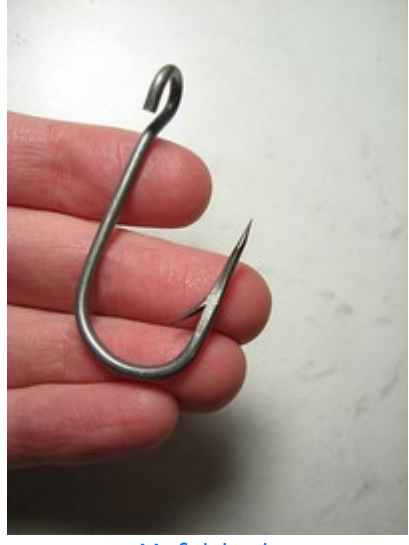
My fish hook

The reason many of us now 'get it' is because we realized that the world is changing, we recognized our responsibility to our students and schools, and we dived in and learned as we went along . Changing inertia into momentum, not waiting for someone to hand us the answer, taking responsibility ourselves rather than blaming others for our own inactivity – that's what life-long learners do. That's what effective educators do. That's what we owe our children.