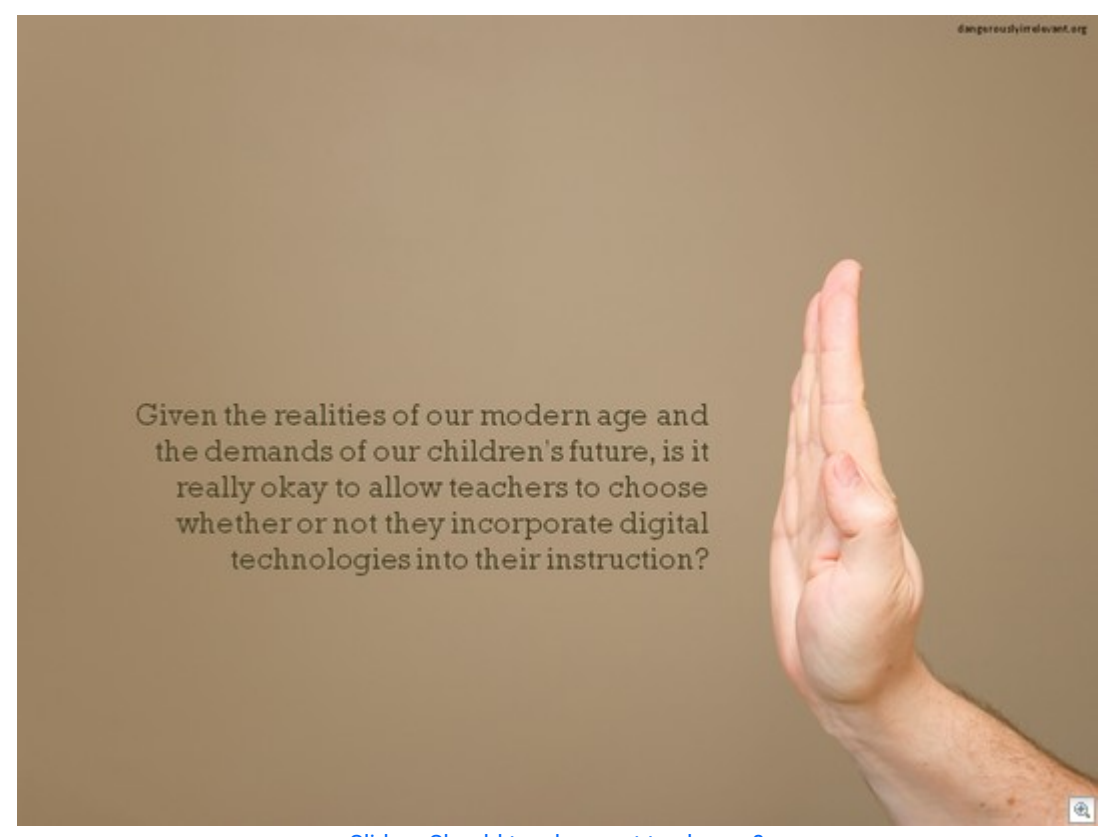
Slide - Should teachers get to choose?

make this happen. But insist on them doing the same.