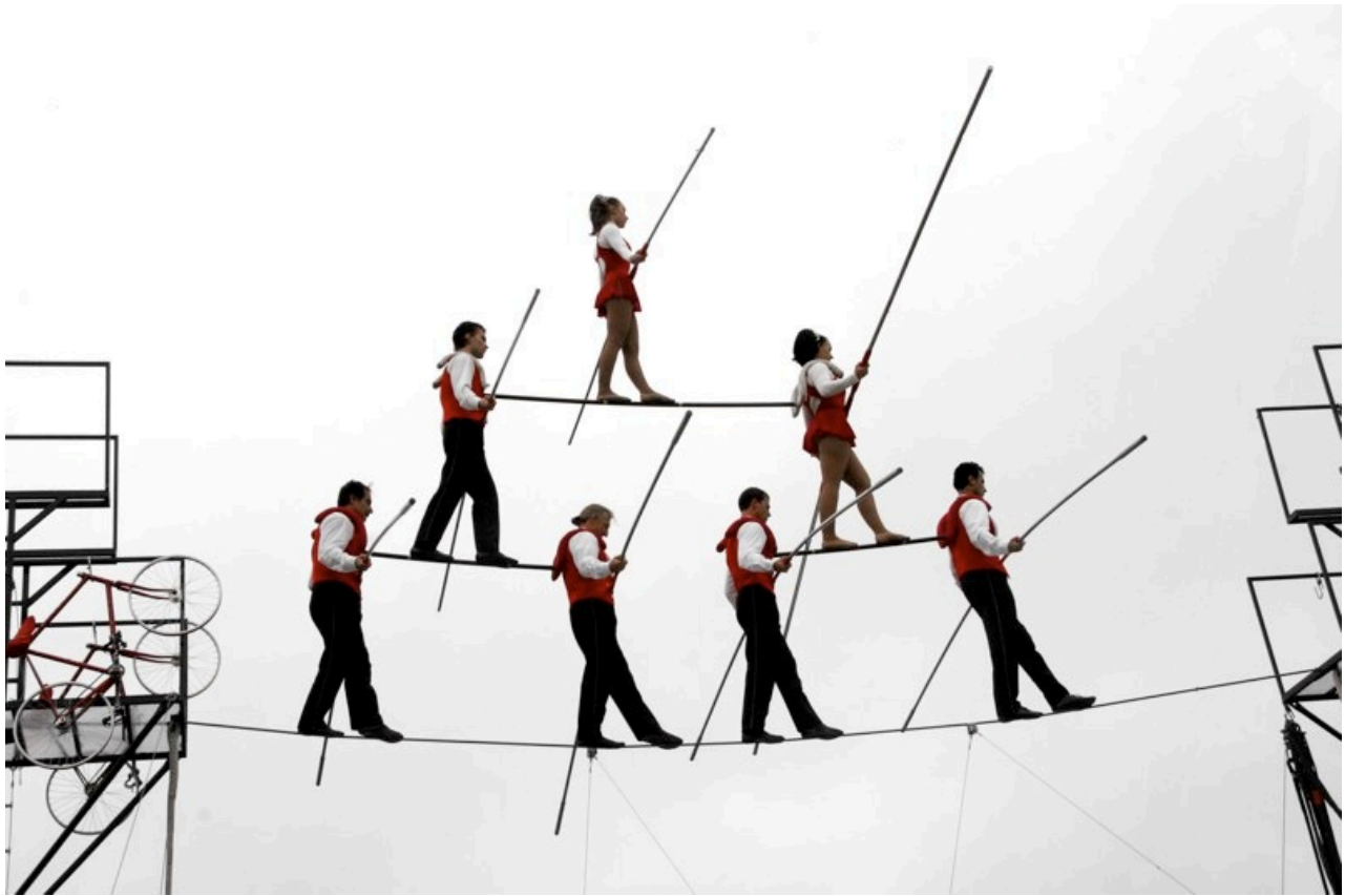
Standing on the Shoulders of Giants

Researchers and companies today don't just start projects out of the blue—they do their homework first by finding out what others have already done. So if you want to make a hoverboard, you don't just go to Home Depot and buy random parts—you research what already exists and talk to the experts so you don't have to reinvent the wheel (get it?).