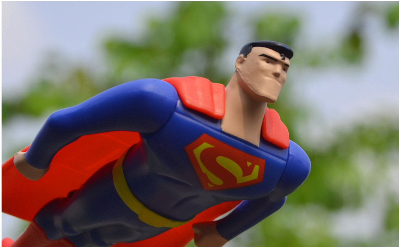
Research saves the day!

It's kind of like a superhero moment when someone publishes that they have a problem (e.g., turns on the Bat Signal or yells "Help!"), and Batman or Superman or Wonder Woman swoops in and saves the day. The authors lay bare a problem or gap in current research, and then they reveal the research they did to solve that problem, fill that gap. Ta da! Research saves the day.