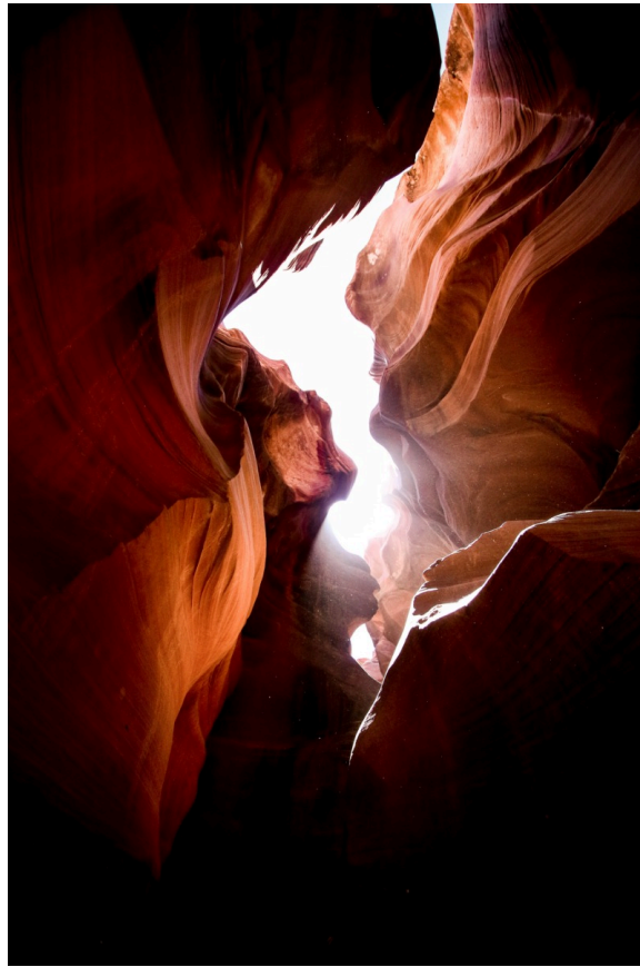
Find the gaps in research.

Before good researchers set up any surveys or experiments, or even write a proposal for funding, they figure out exactly which research questions have already been asked and answered. Same goes for anyone wanting to make a product that will sell. But more importantly, they look for the gaps in the research or marketplace where answers have yet to be found. And then they focus their own work on filling in some of those gaps. That'll be your job, too.