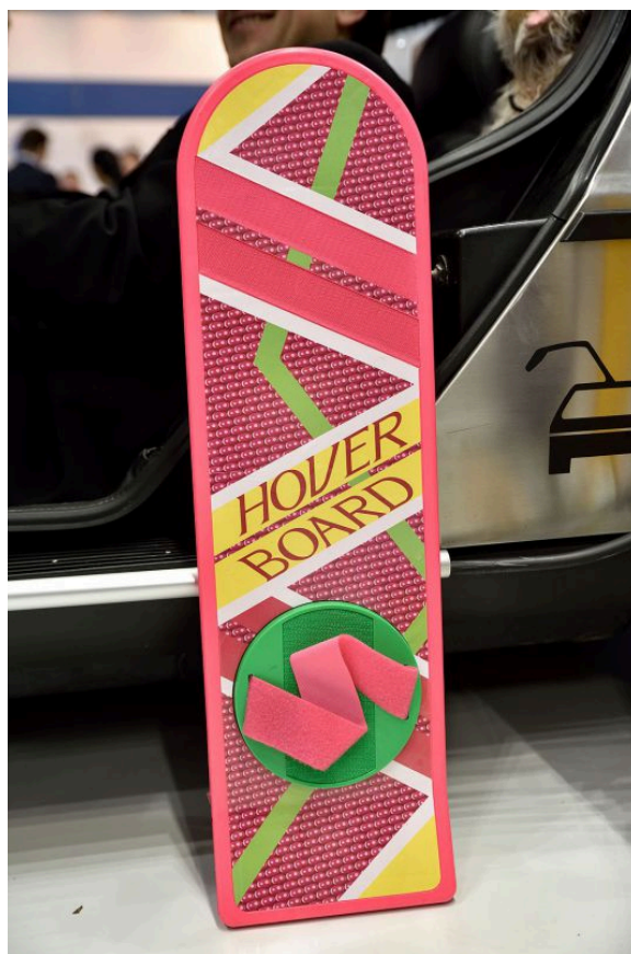
According to Marty McFly, this is a Hoverboard.

The straightforward answer is that a literature review is a review or synthesis of all the research published on a certain topic. But I'd rather explain it from a skateboarder's perspective: