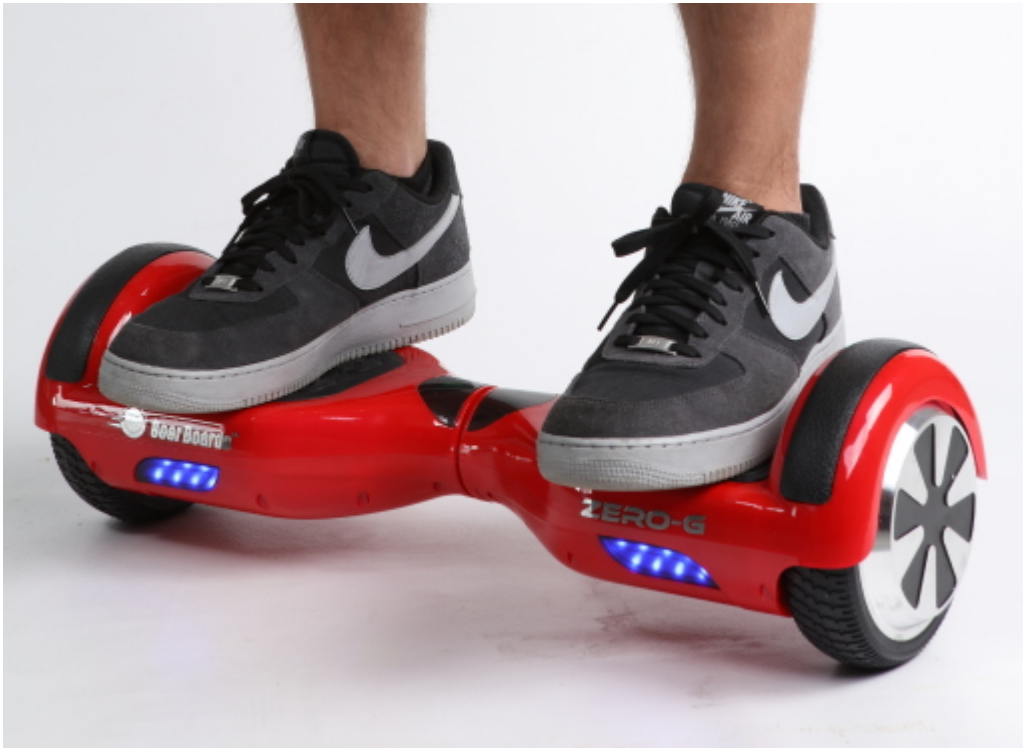
Is this a real hoverboard? I think not.

I want a real hoverboard. That you ride in the air . So how can we know when real hoverboards will be available? How can we know where the technology is now? Will we know a real hoverboard when we see one? Tony Hawk, the best skateboarder of all time (whose face was incidentally taped to my wall in the '80s) recently filmed a 2-minute video of how far real hoverboard technology has come—filmed on the very day Marty McFly supposedly went to the future: October 21, 2015: