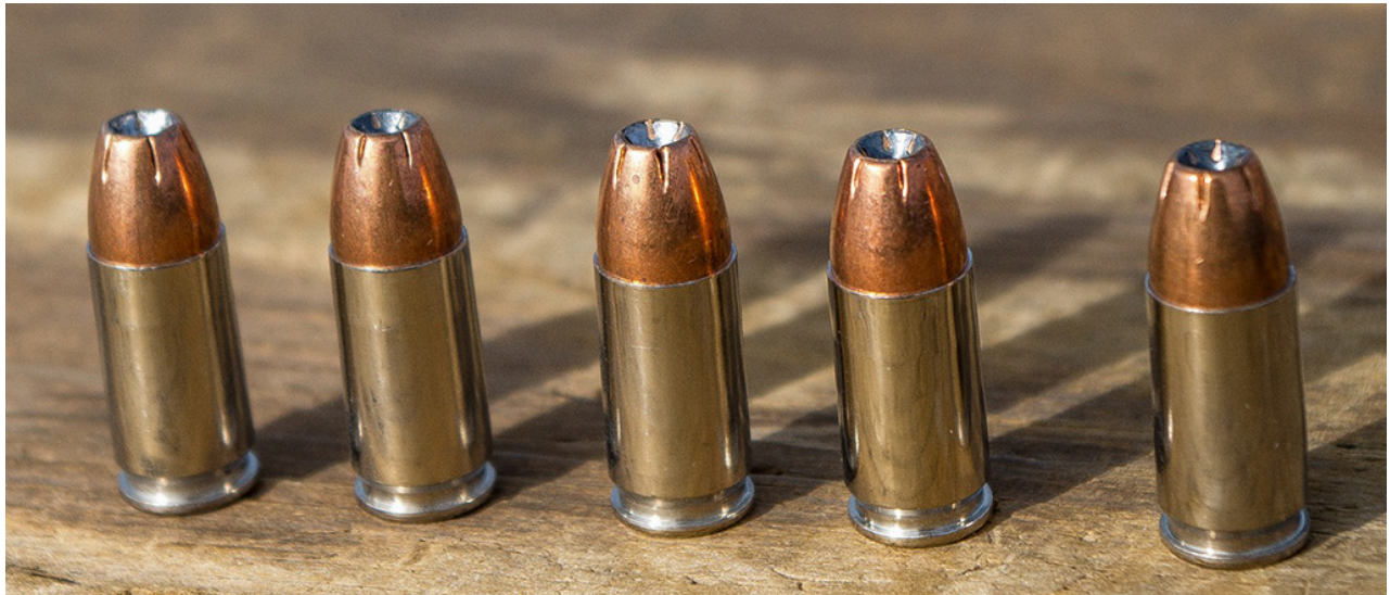
Bullet points help readers speed through your resume.

smart) when all you remember is watching Leonardo DiCaprio play Romeo during movie day in your sophomore English class. You may find yourself in a very uncomfortable position when your interviewer asks which of the Bard's sonnets is your favorite.