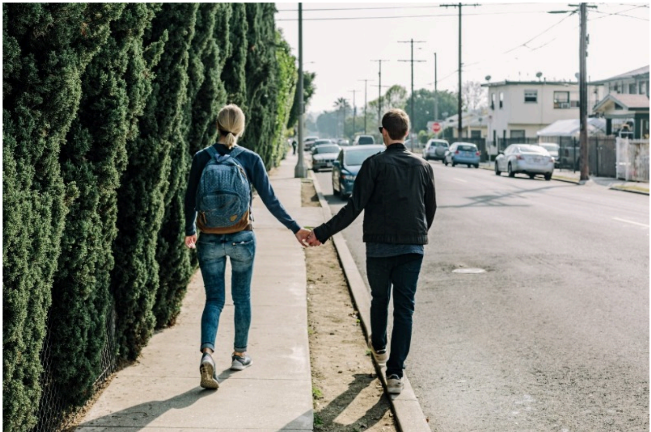
A recent BYU student research project looked at shyness and its effects on romantic relationship expectations and satisfaction. The funding for the project was achieved through submission of a proposal.

Have a good idea for a project? Find a faculty member who is willing to back you up, write a solid proposal using this chapter, and you have a decent chance of getting funds to make it happen.