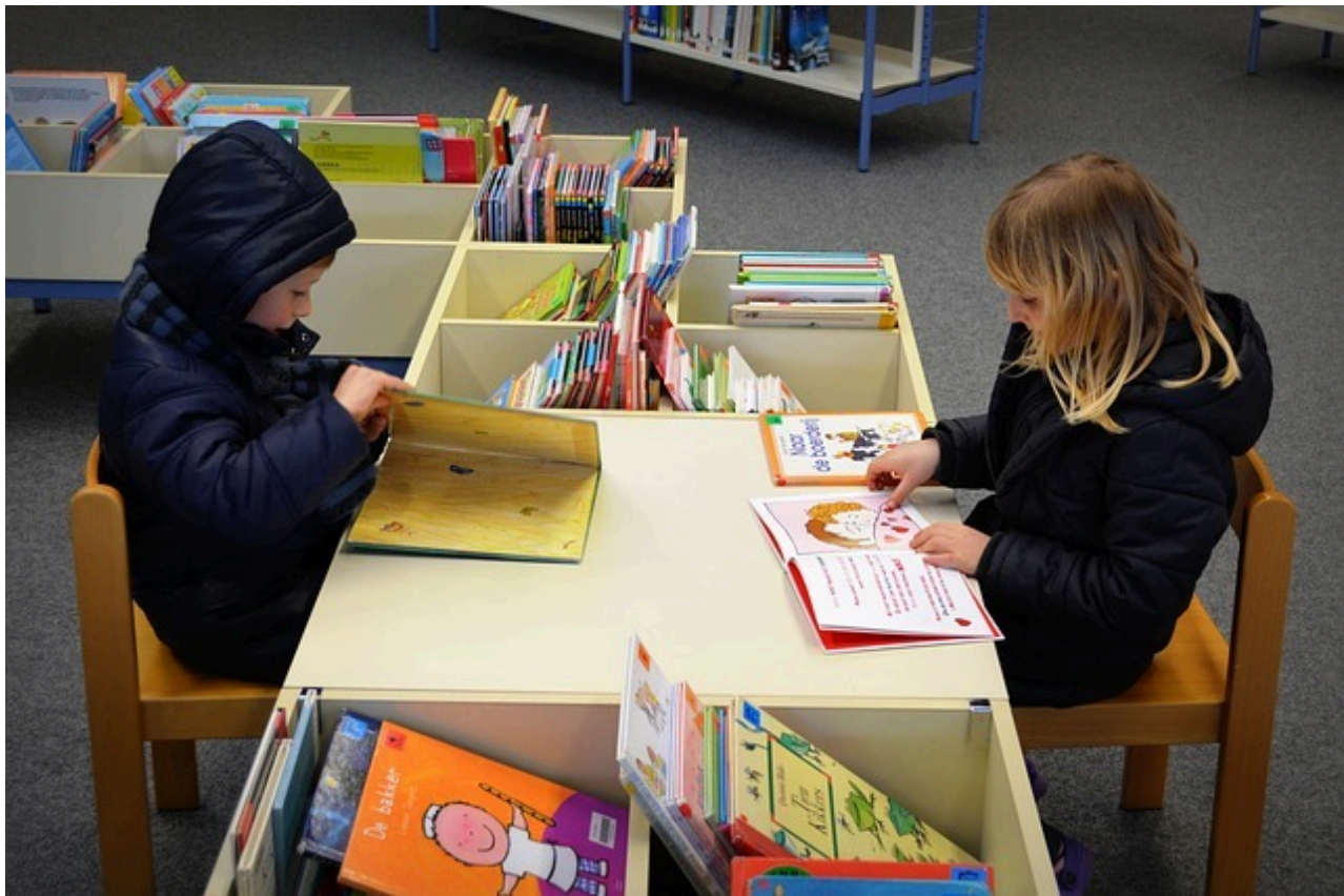
Local school districts submit proposals to receive federal government funding for Head Start, a research-backed program for early childhood education

The uses of a proposal document are as diverse as the problems they address. To flood you with examples—charity organizations submit grant proposals to various donors asking for funding to initiate a new projects or sustain efforts; contractors submit bids (proposals) to complete work on construction projects; city councils file proposals asking for funding to improve city infrastructure; entrepreneurs request investment money for business start-ups; teachers write grant proposals asking for additional classroom equipment; venues pitch their location for an event; employees suggest ideas for solving company problems to higher-ups; academics submit proposals seeking permission to present at professional conferences; researchers seek funding to conduct research; graduate students ask for go-ahead from faculty to proceed with a large project.