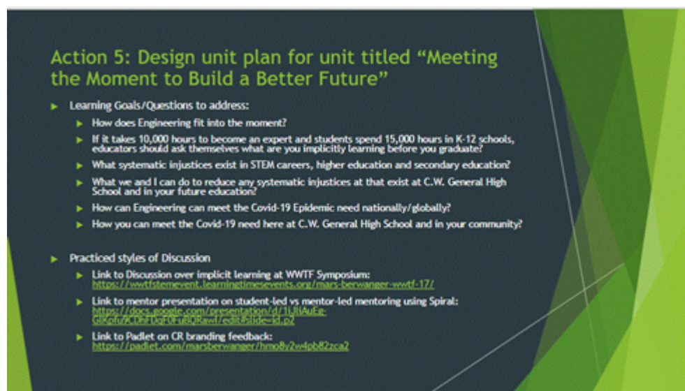
Picture of a PowerPoint slide describing the overview of a STEM careers unit