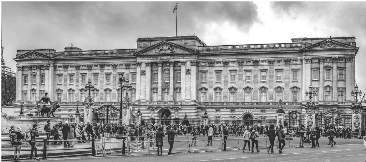
Buckingham Palace

England whose ideas about and practices of democratic government influenced the American colonists and the political institutions that developed in colonial America has had kings and queens for more than 1,200 years. The current royal family traces its lineage back to William the Conqueror. Not surprisingly, whatever the British royal family does generates an enormous response in print and online media.