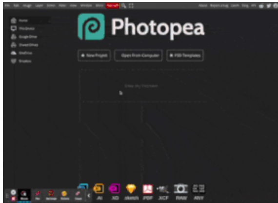
Photopea.com: how to create a new project and fill with foreground color.